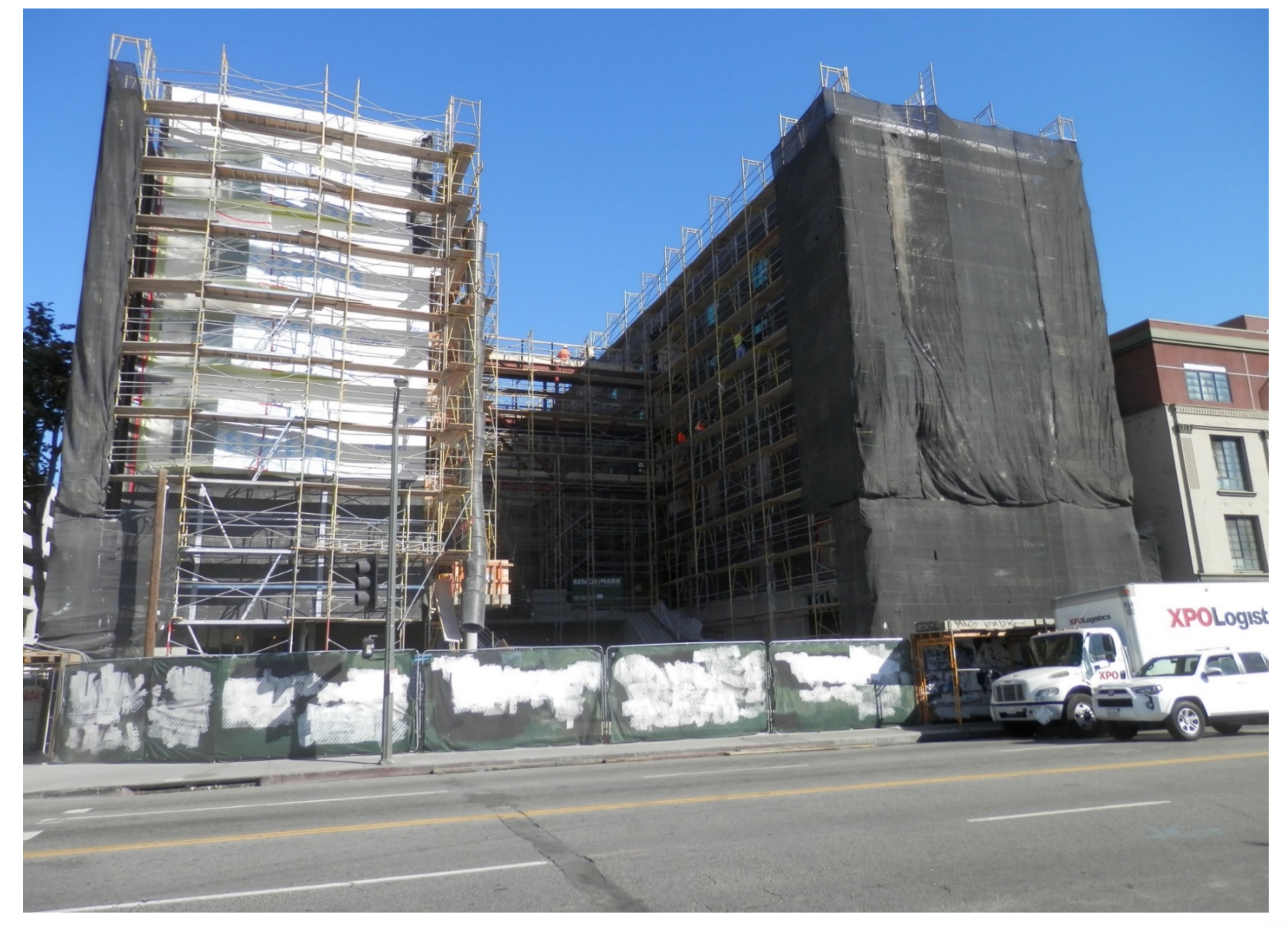
Located at 401 E 7<sup>th</sup> St. View from across the street.