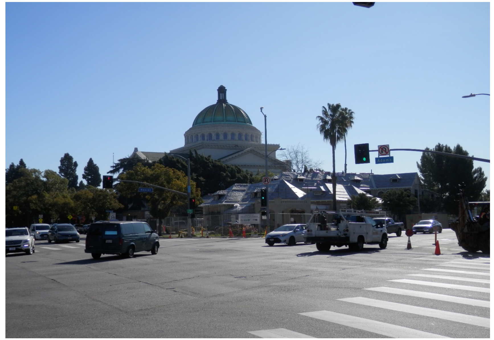
View from across the street on Adams St. & Hoover.