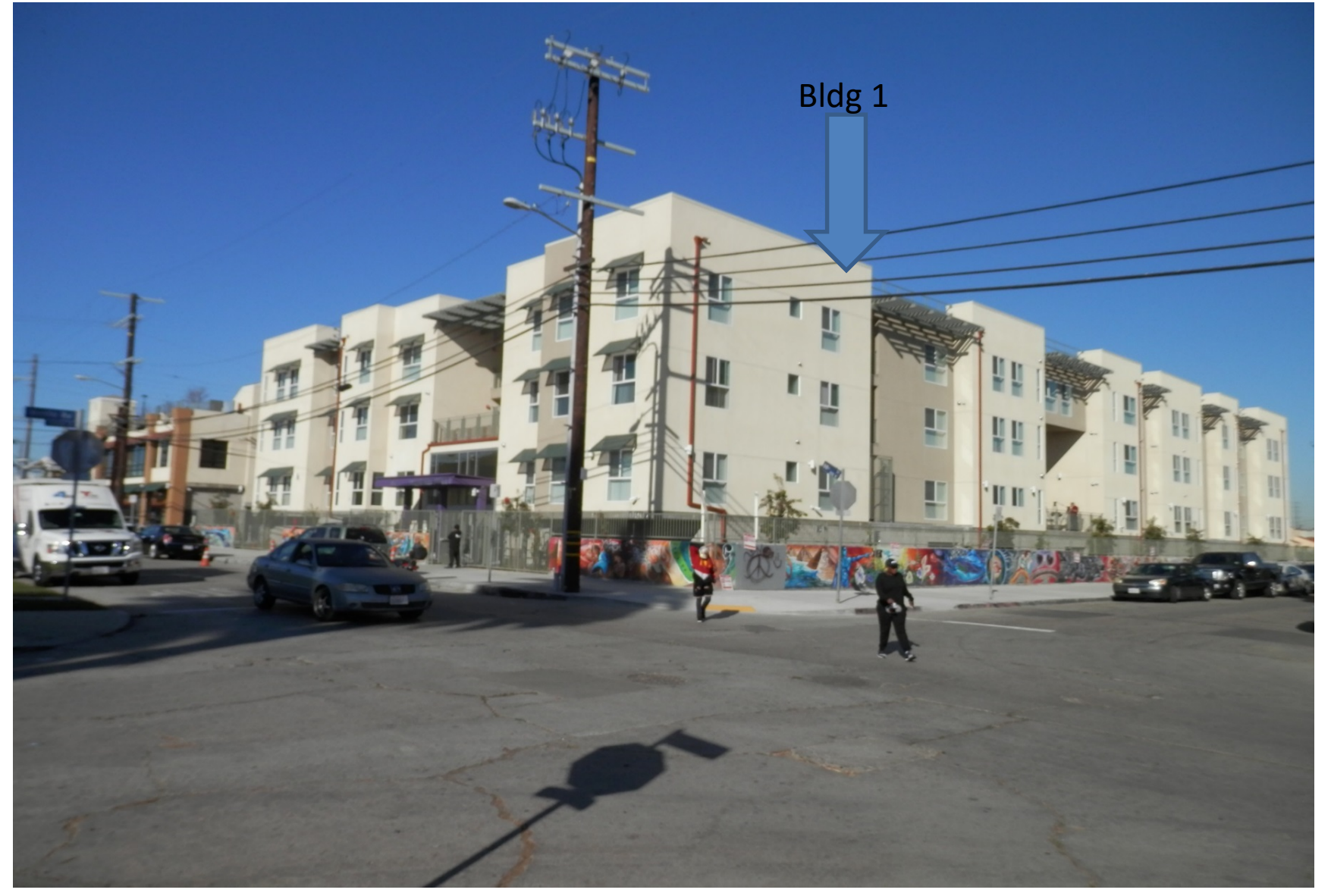
Located at 8707-27 S. Menlo Apts. Bldg 2 residential. View from Menlo & 88th.