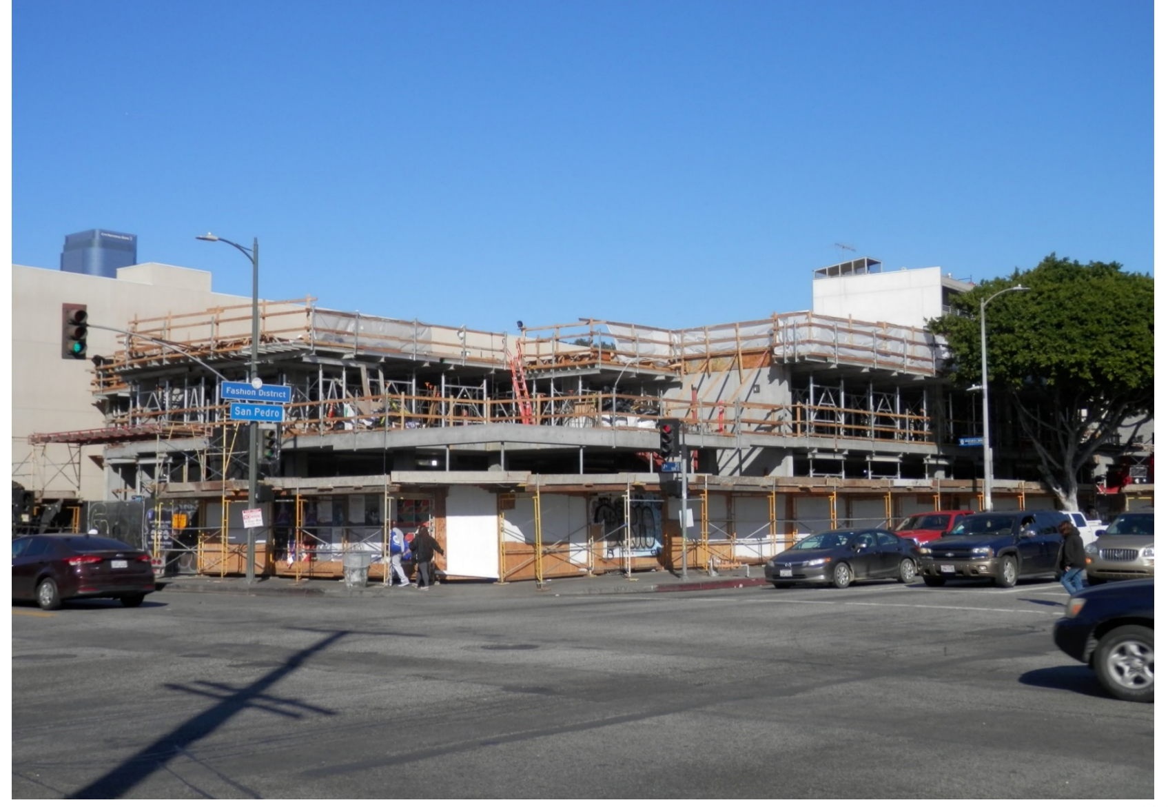
Located at 519 E 7<sup>th</sup> St. View from across the street on 7<sup>th</sup> St.