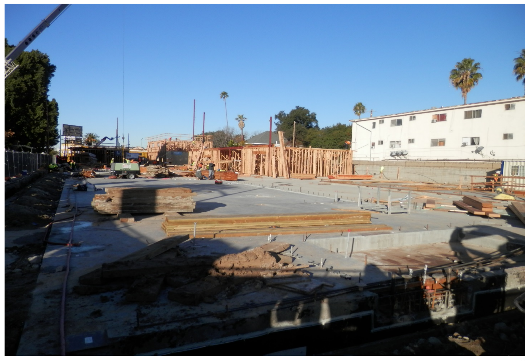
Street view from entrance to site at Washington & Gramercy.