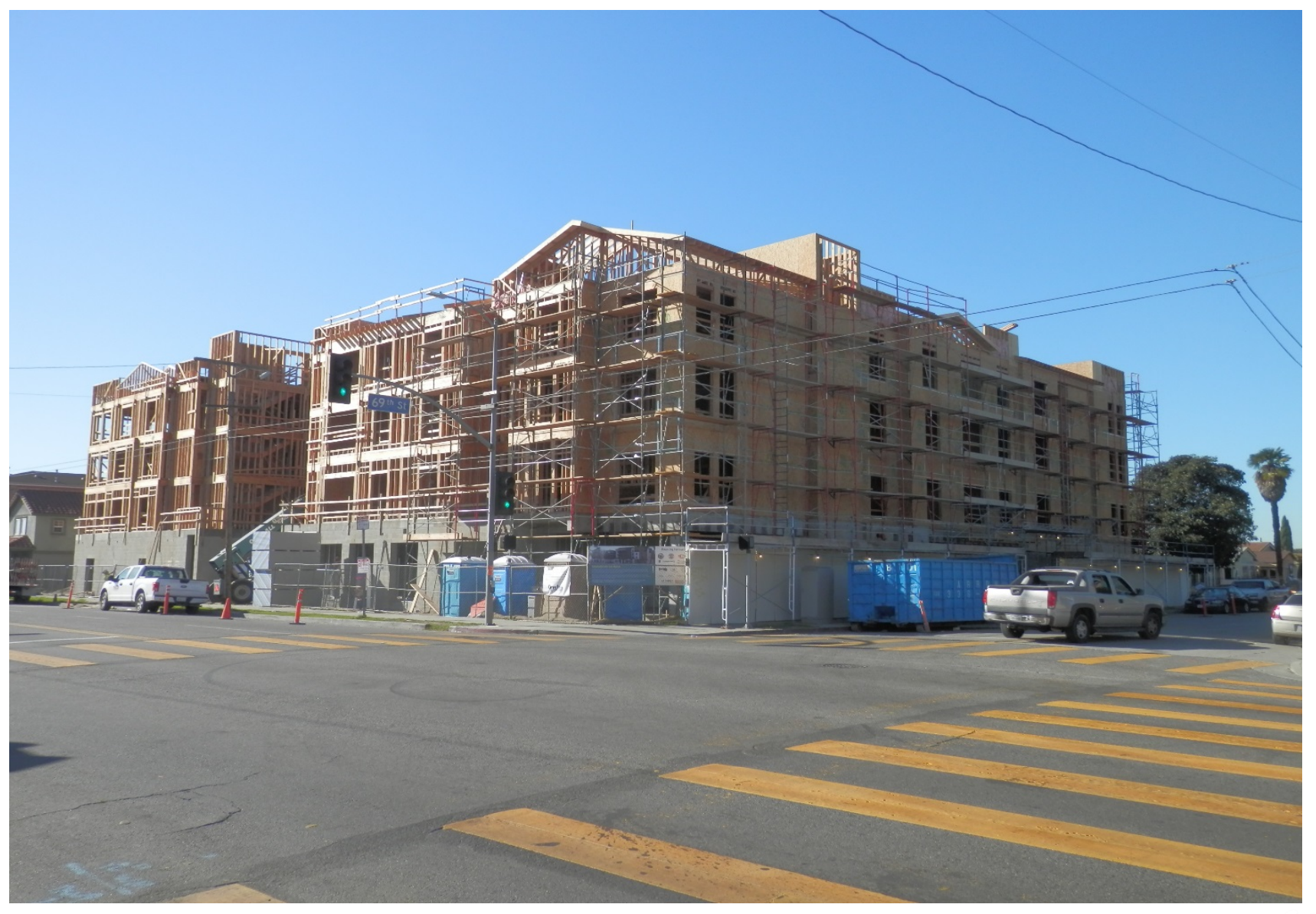
View from across the street on Main & 69<sup>th</sup> St.