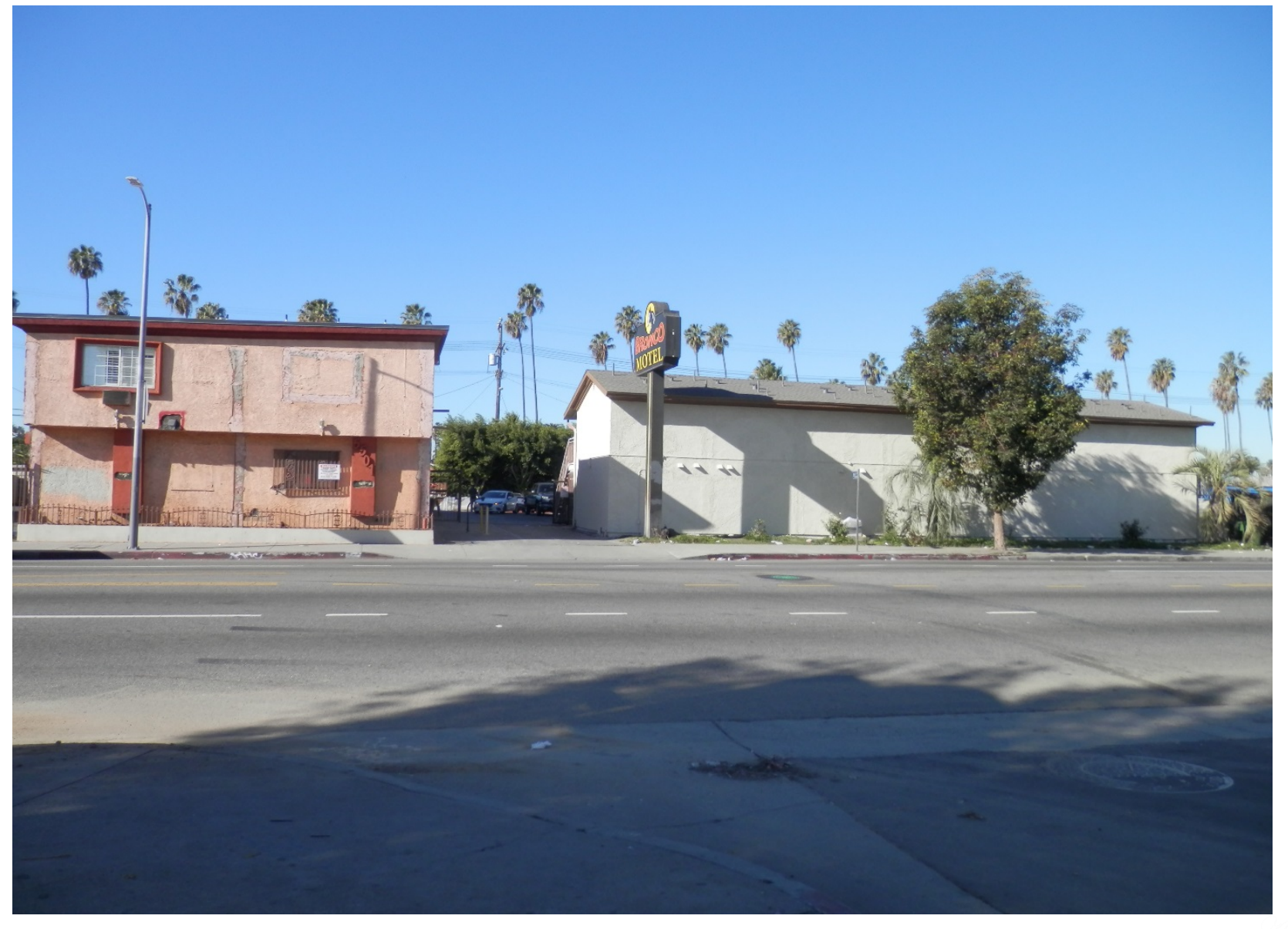
View from across site at 5501 S. Western Ave.