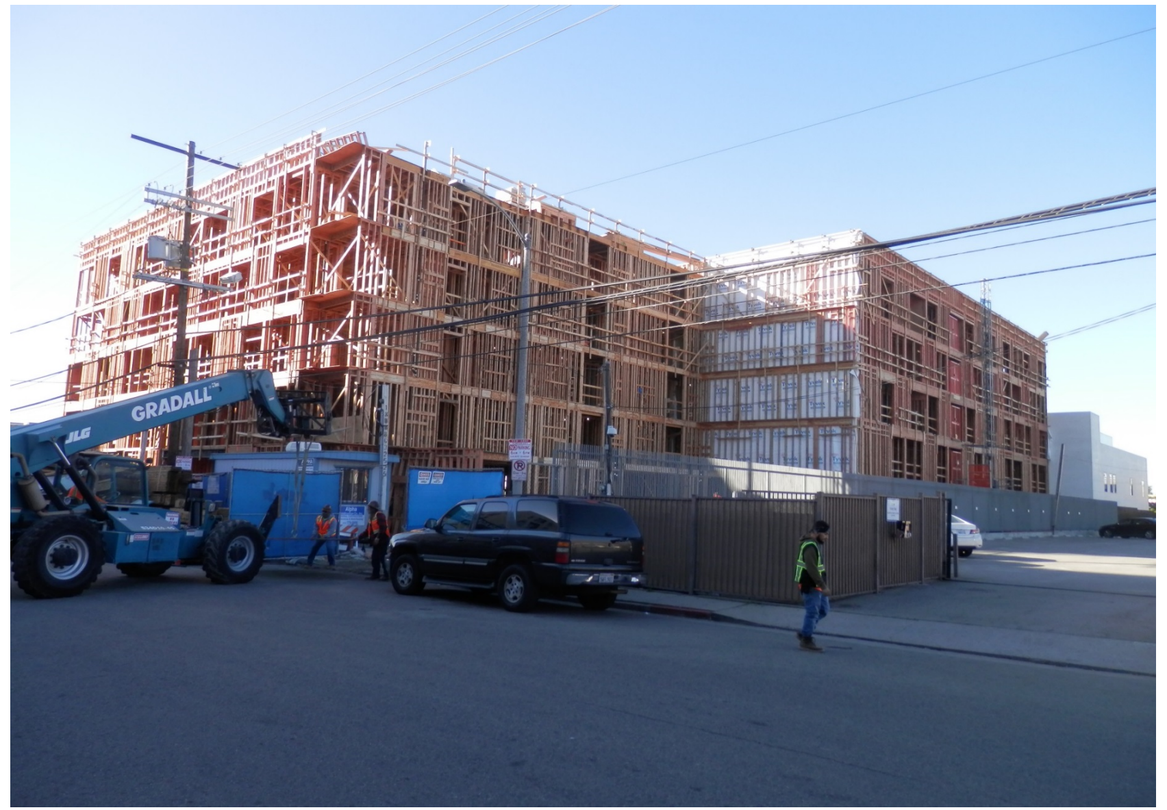
Located at 1119 N. Mc Cadden Pl. Street view from front of site on Las Palmas St.