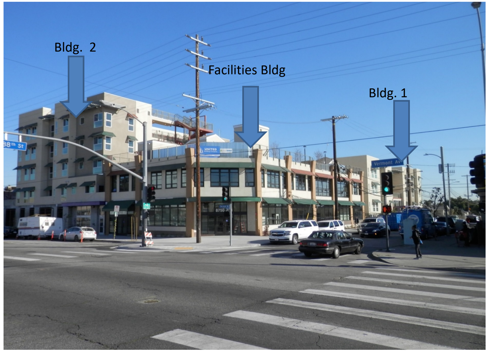
Located at 8707-27 S. Vermont Building 1 & facilities view from 88th & Vermont.