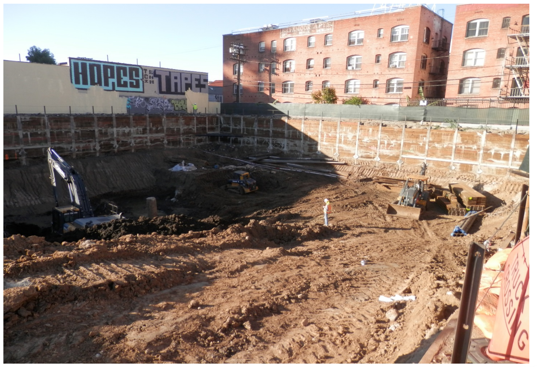
View from inside of the construction fence at 433 S Vermont.