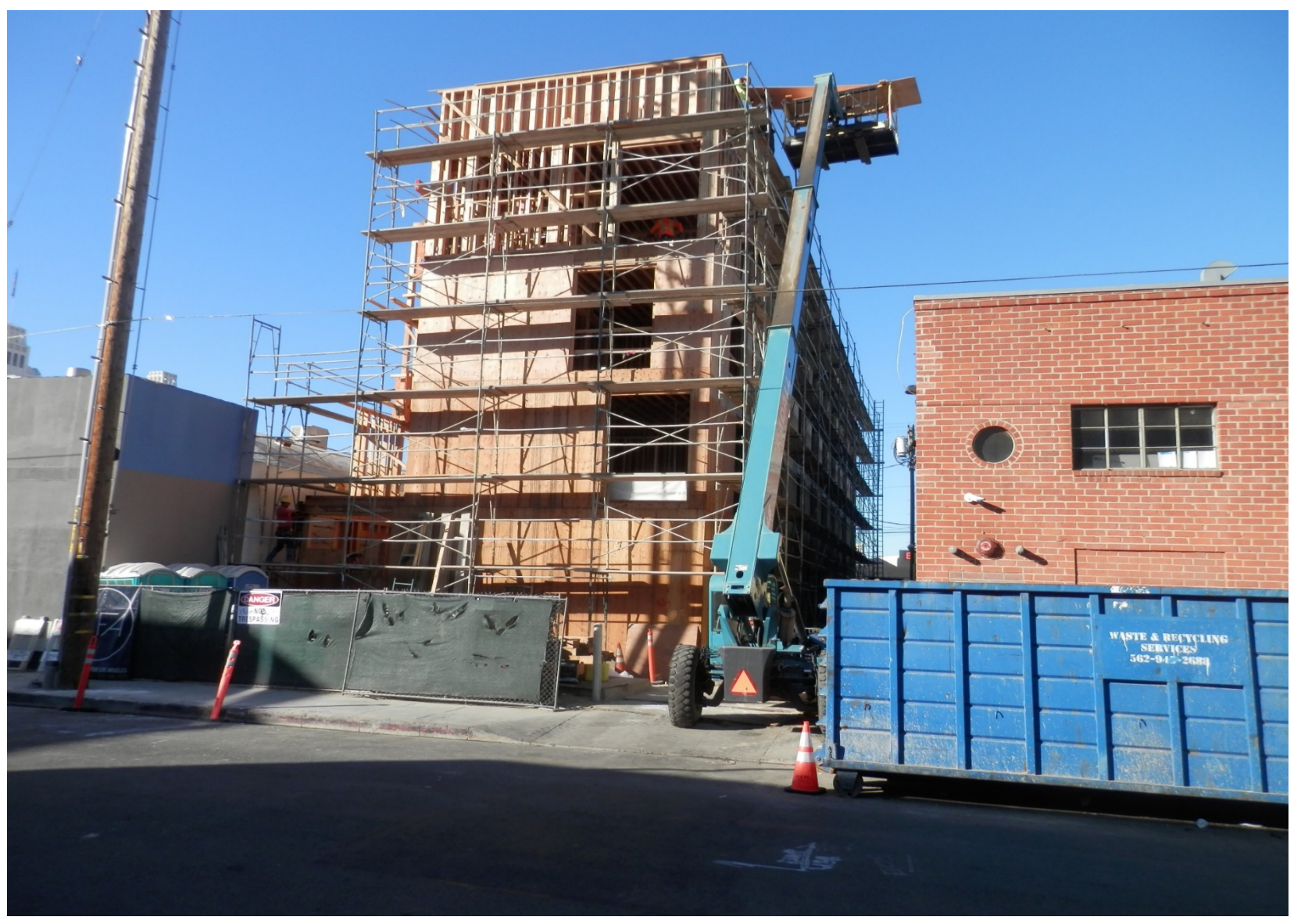
Located at 1119 N. Mc Cadden Pl. View from the front of site.