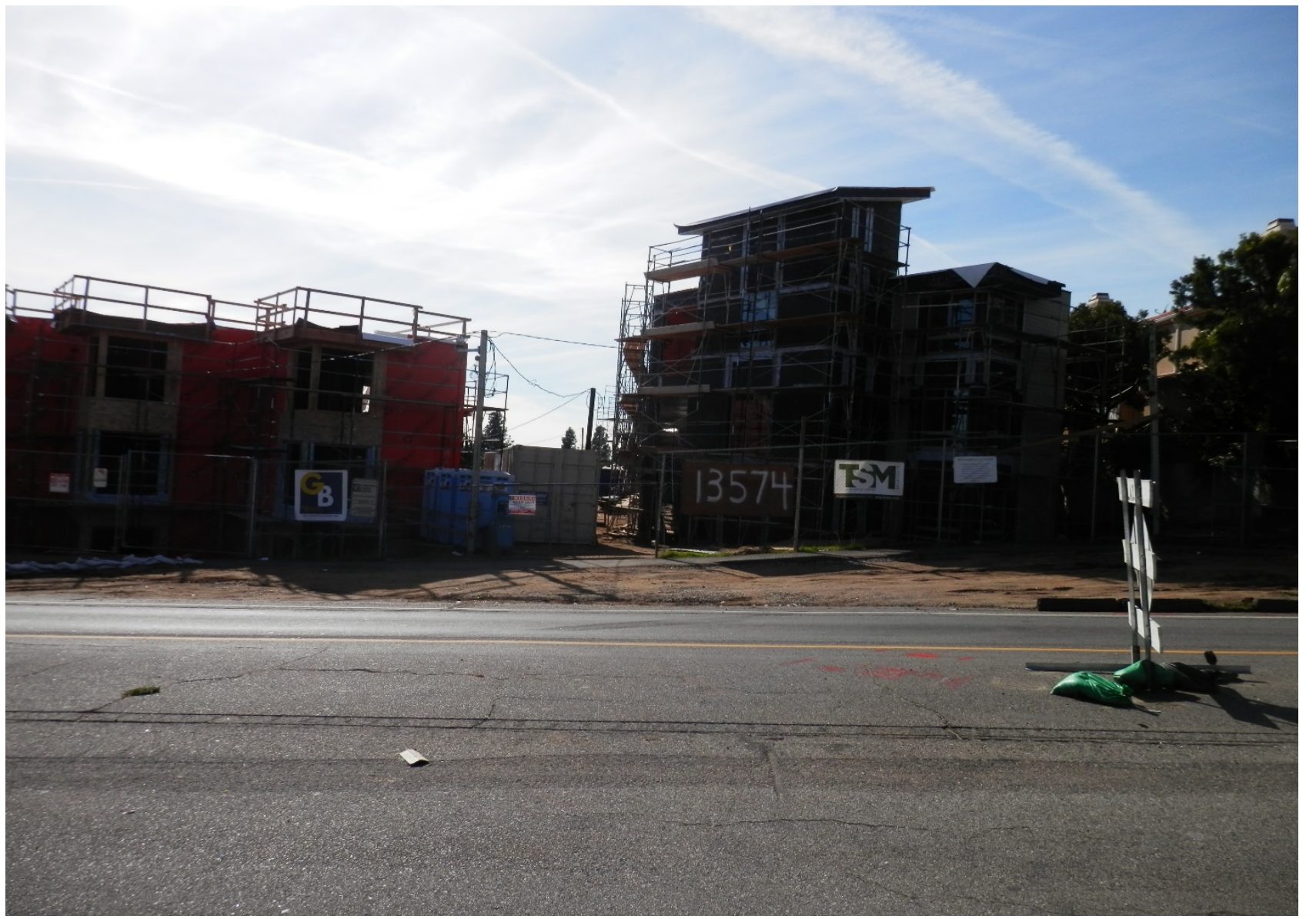
View of the two buildings from front of the site at 13574 Foothill Blvd.