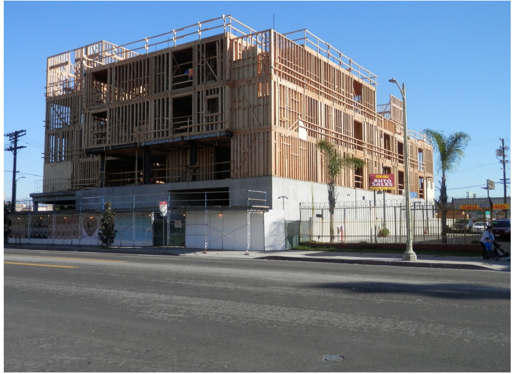
Located at 4050-60 S. Figueroa St. View from across the street of site.