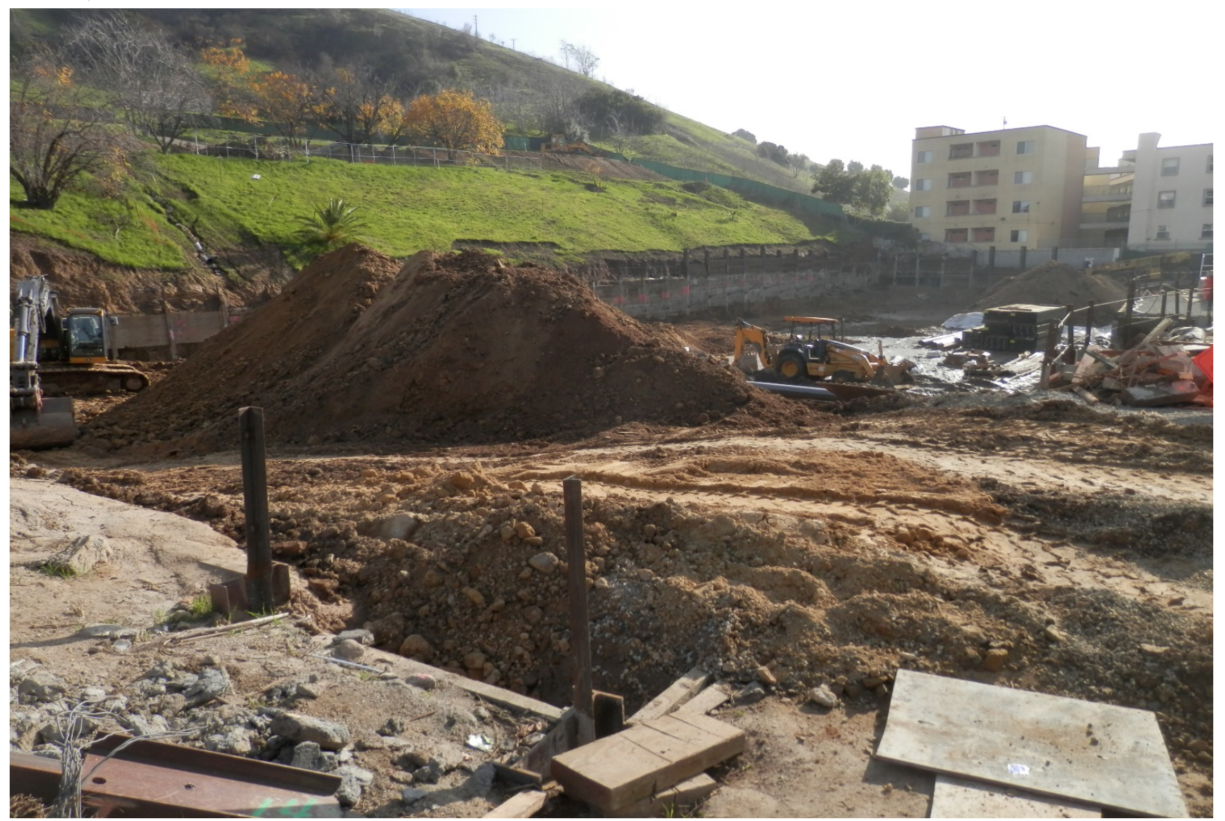
View from inside the construction fence at 4208 E. Huntington Dr. South.