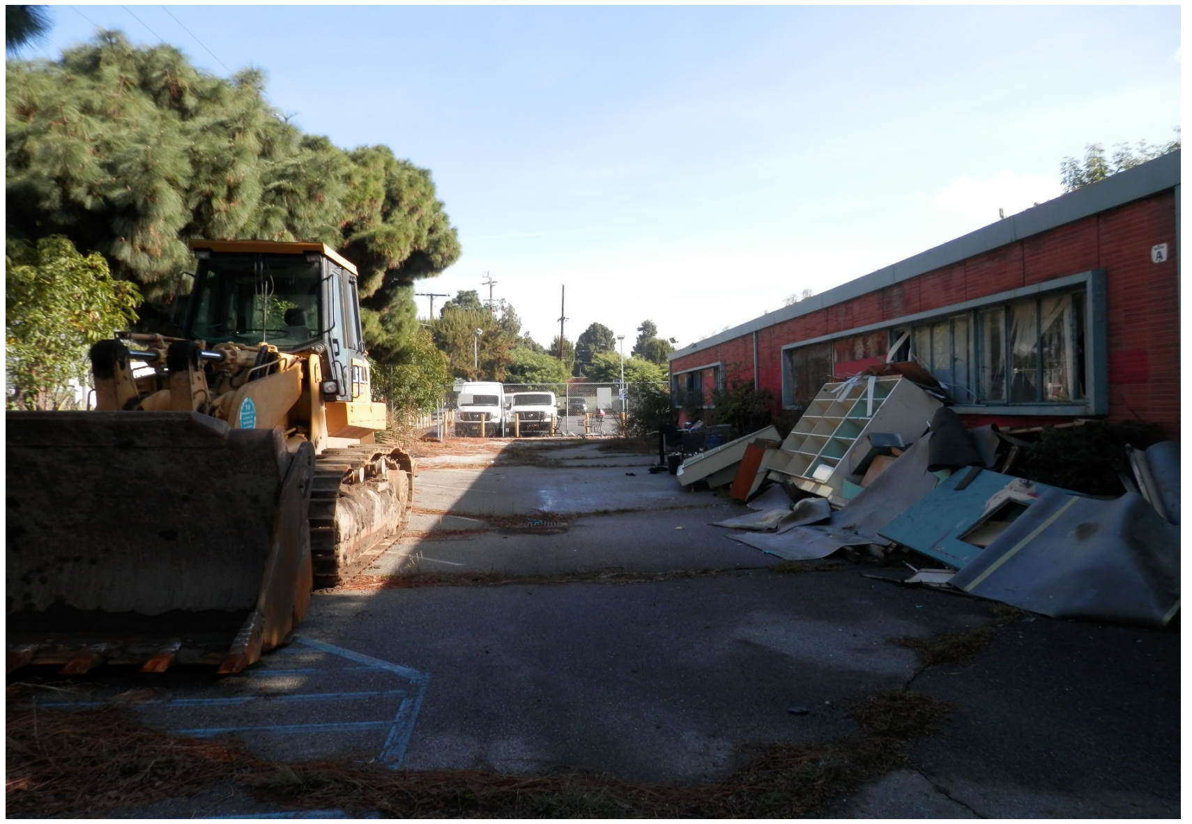
View from just inside the construction fence at 11950 W. Missouri St.