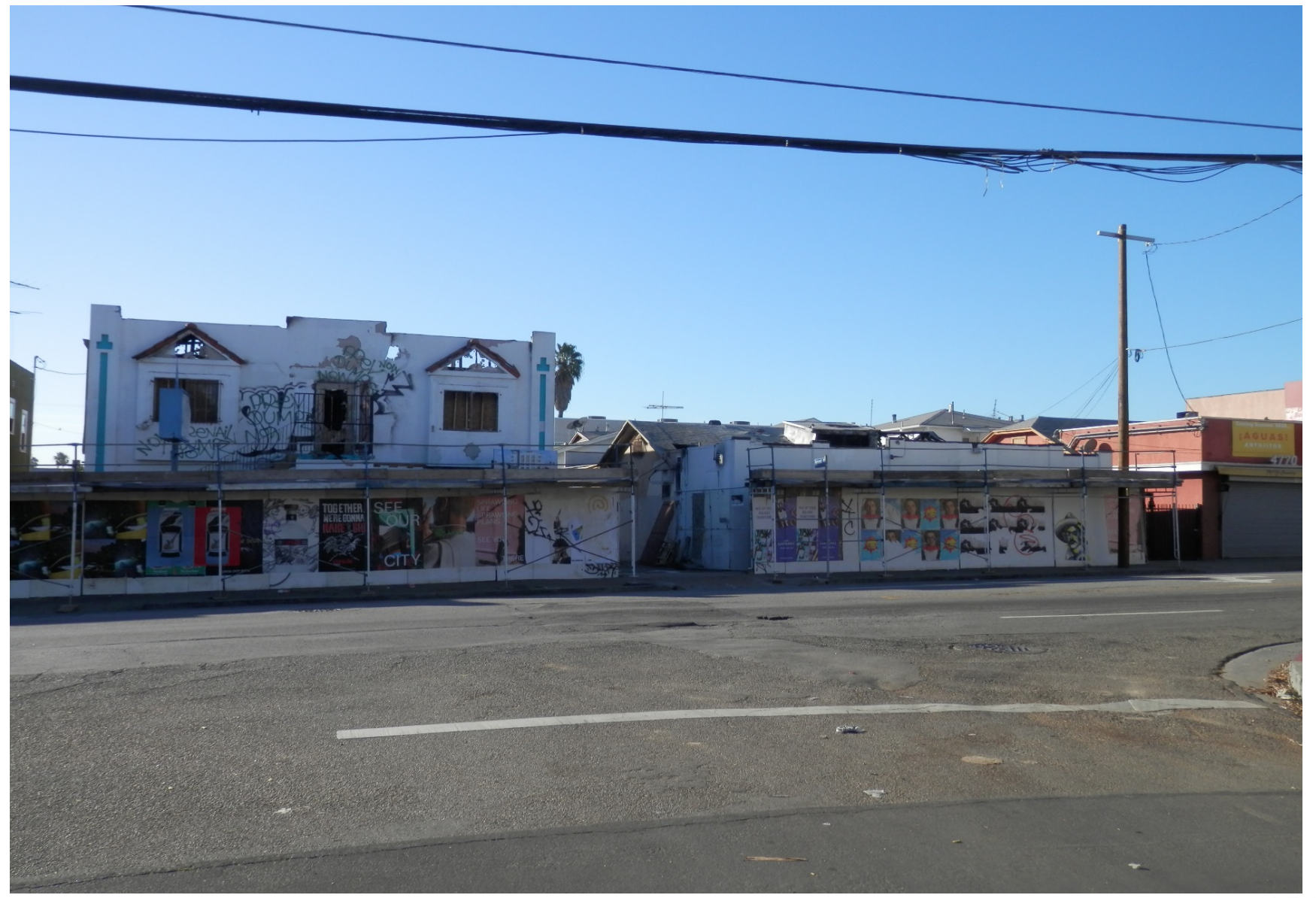
View from across the street at 4760 Melrose Ave.