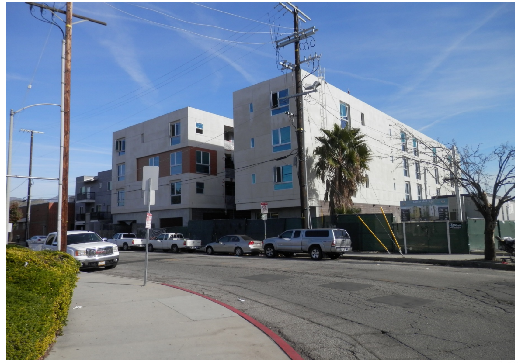
Located at 10966 Ratner St. View from across street of site.