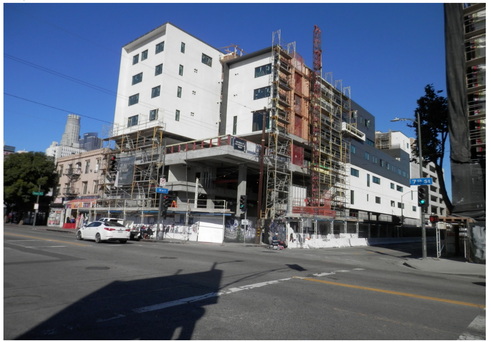
Located at 649 S. Wall St. View from across the street of 7<sup>th</sup> St. & Wall St.