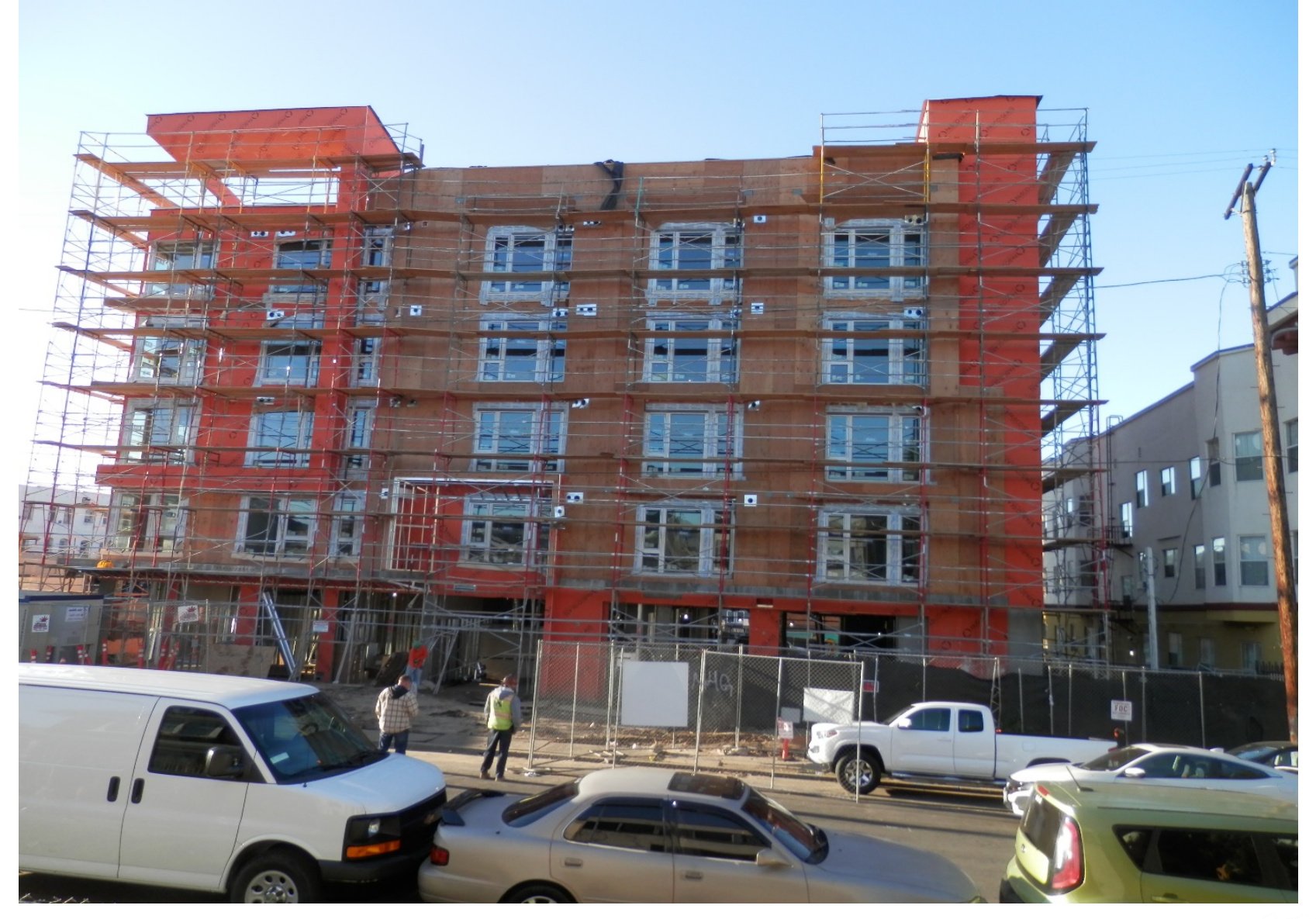
Located at 1532-38 Cambria St. View from across the street of site.