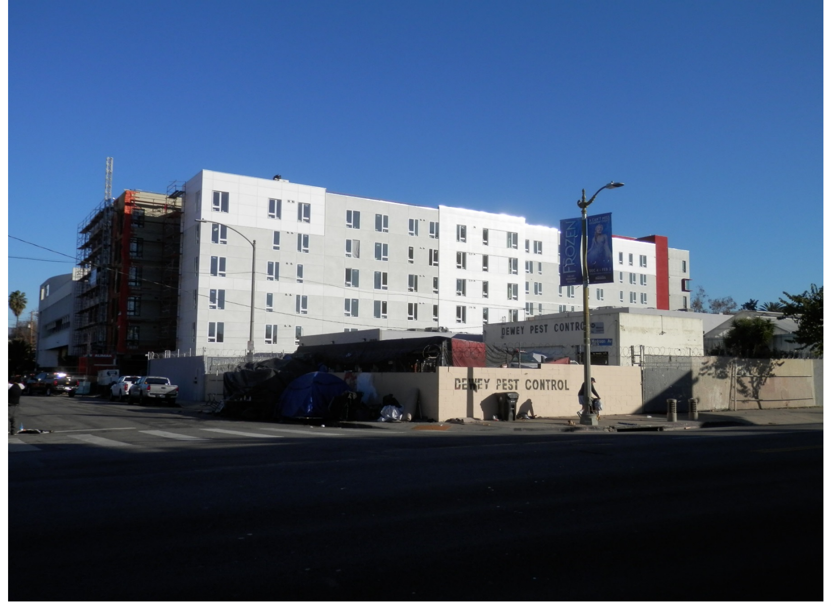
Path Metro Phase 2. View of site at corner of Beverly Blvd & Madison Ave.