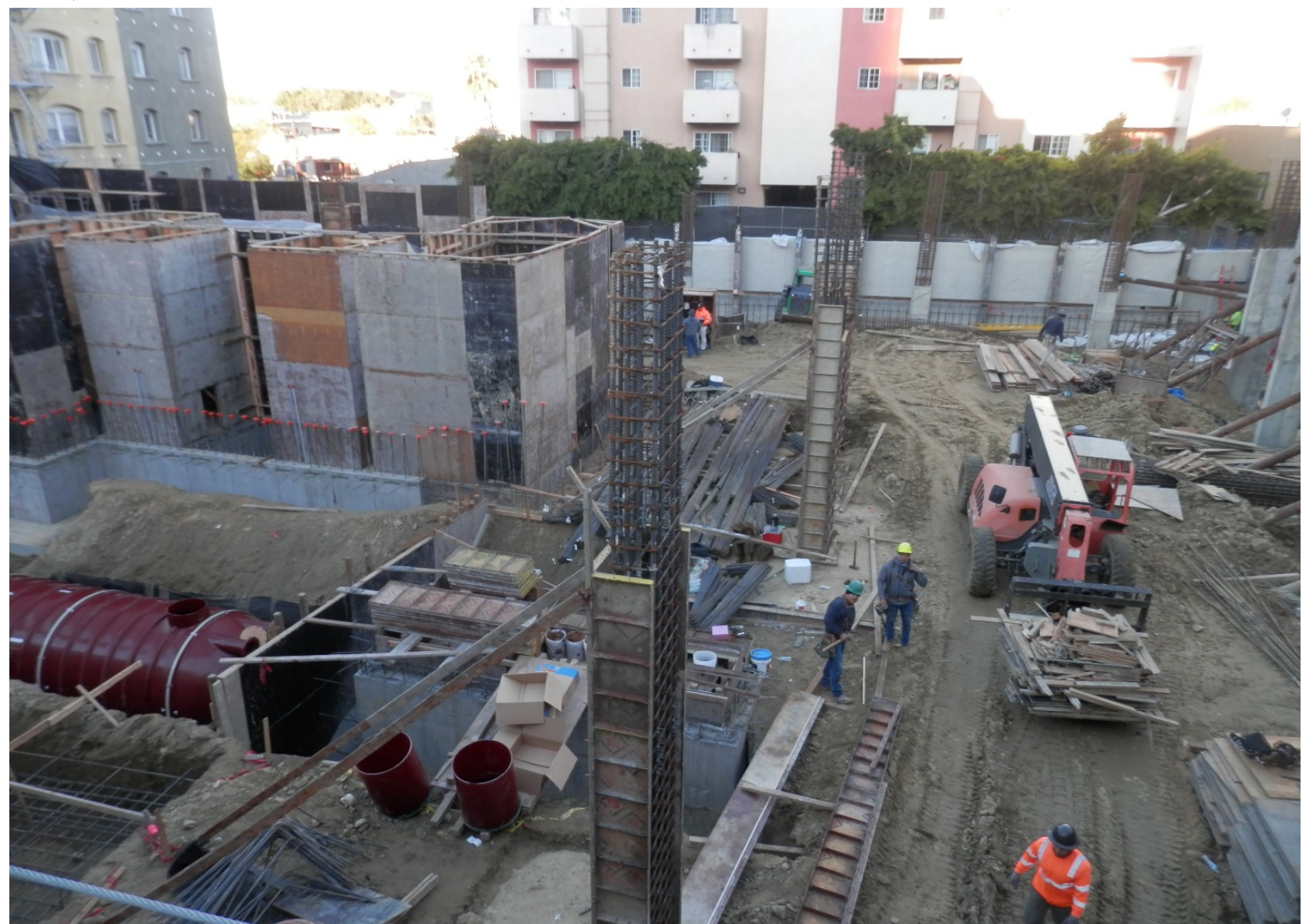
View from inside the construction fence at 445 S. Harford Ave.