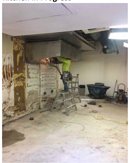
Kitchen in Progress