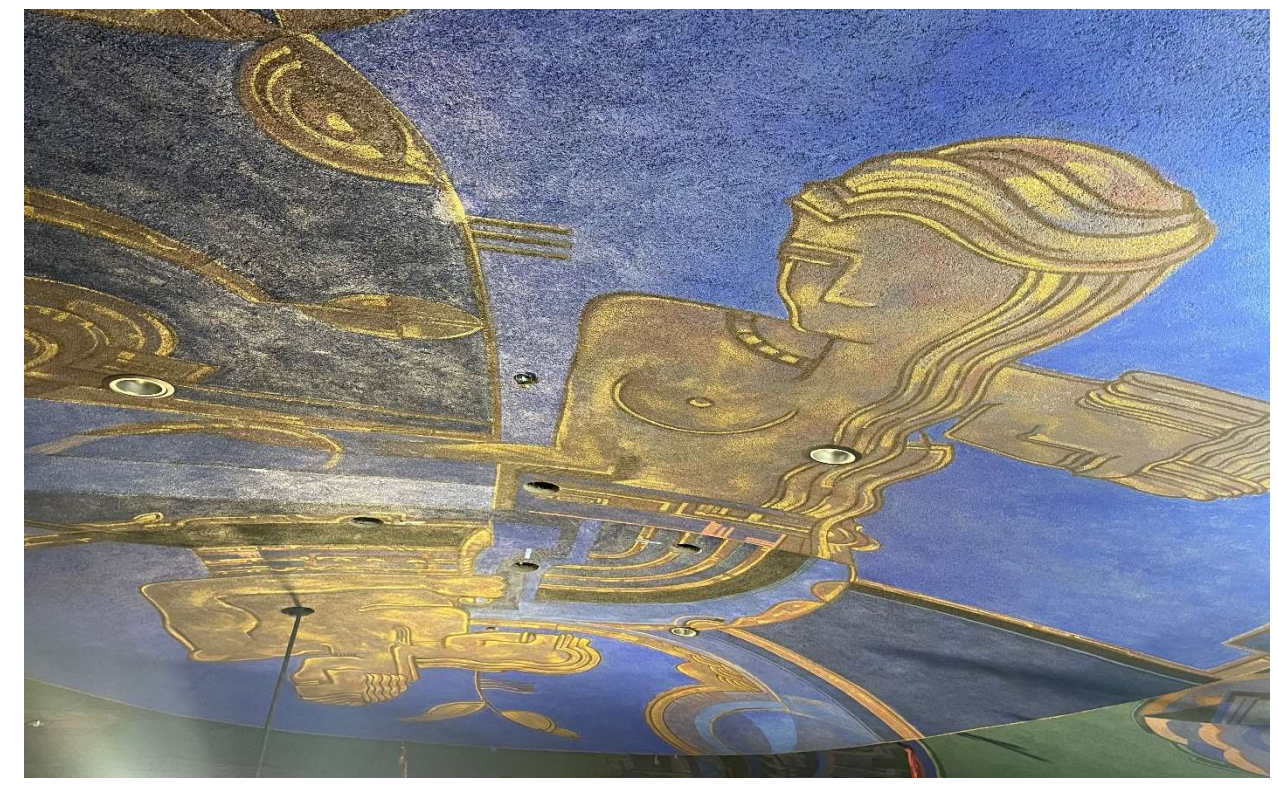
Vision Theatre historic ceiling restored (mural detail)