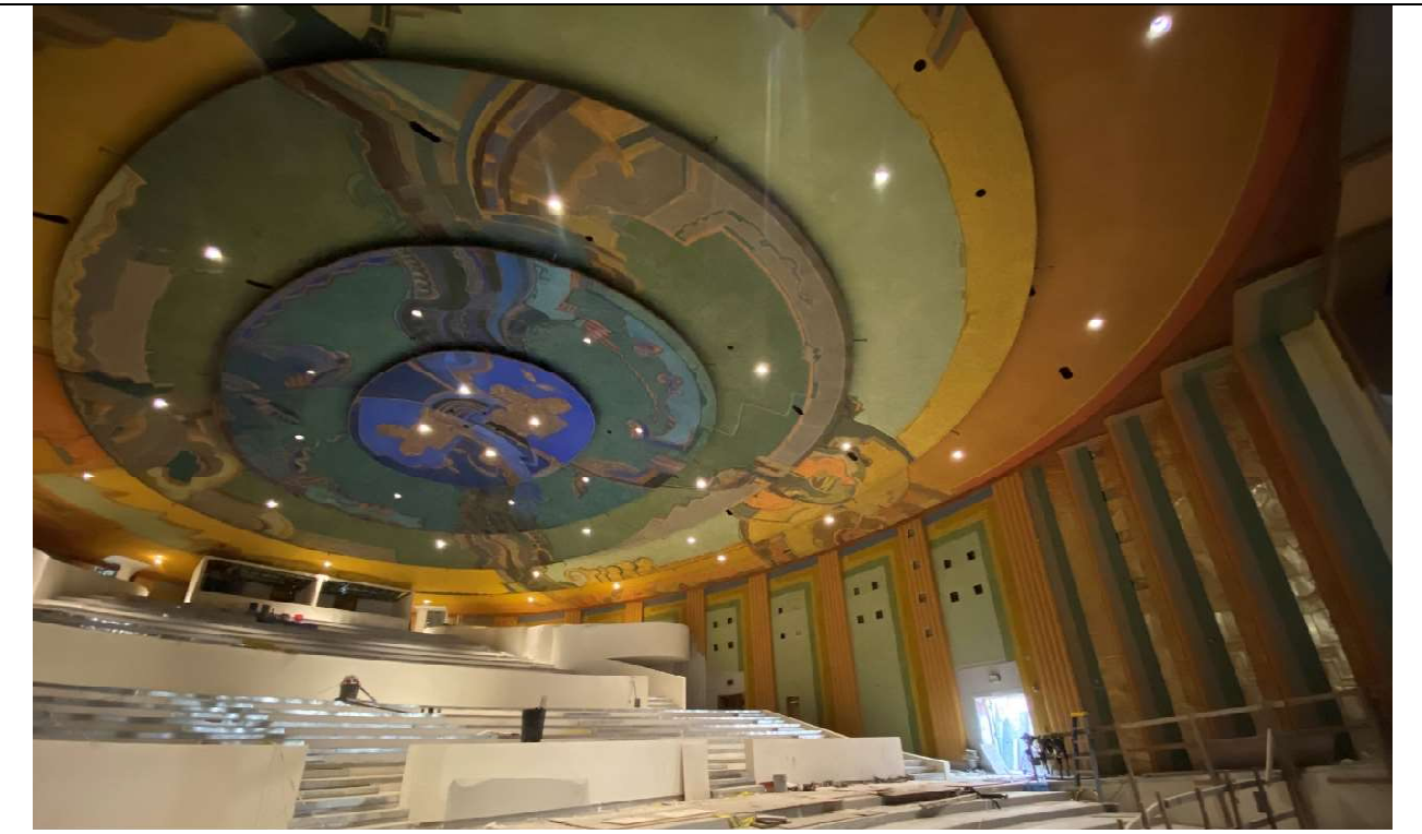
Interior view of the Vision Theatre audience chamber & historic ceiling (restoration in-progress)