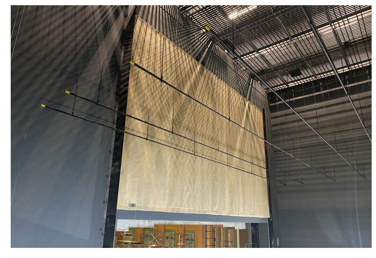
Interior view of the stage, fire curtain and fly-loft area