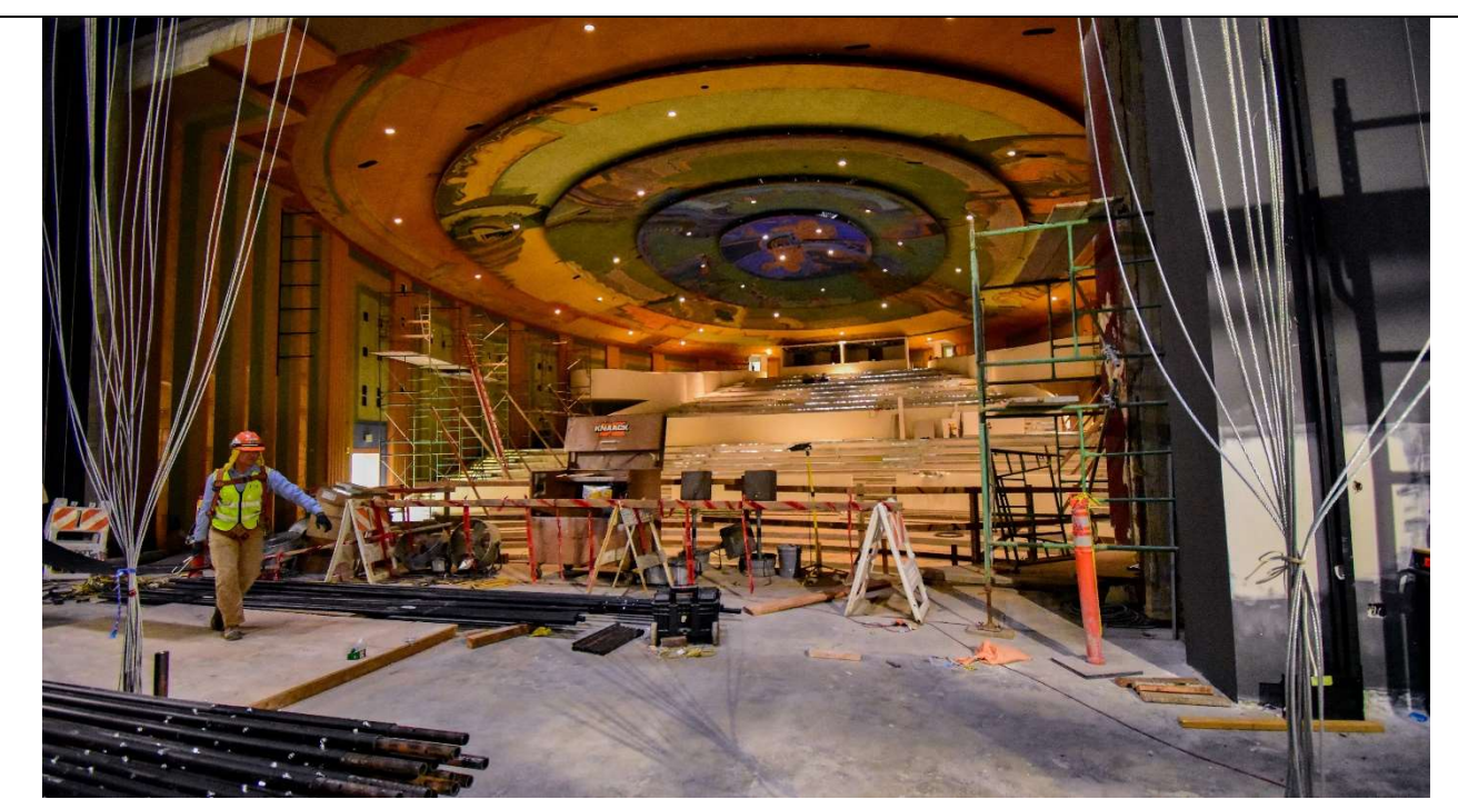
View of the Vision Theatre audience chamber & historic ceiling from the stage