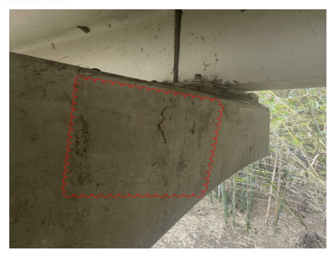
Minor Spalls on the South Pier