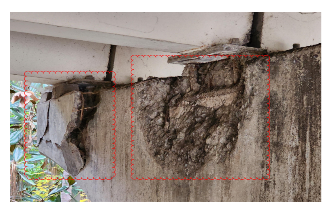
Spalls With Exposed Rebars on the North Pier