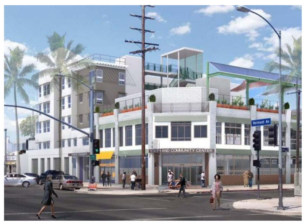
Community Build & WORKS