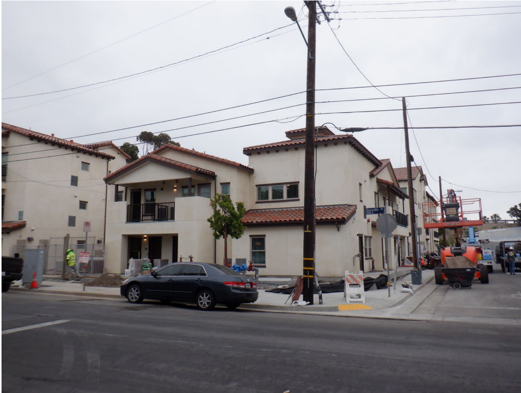
View from Bonsallo Street and 720 W. Washington Blvd.