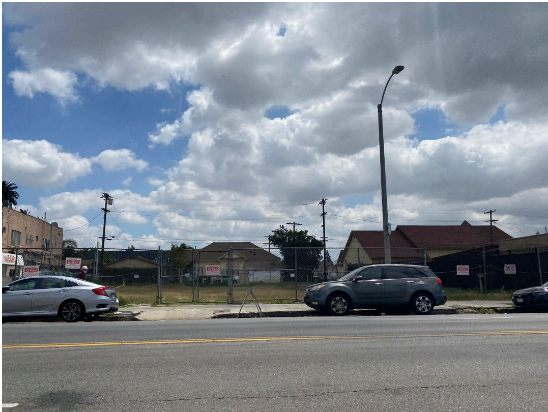
View from across the street at 2106 S central Ave.