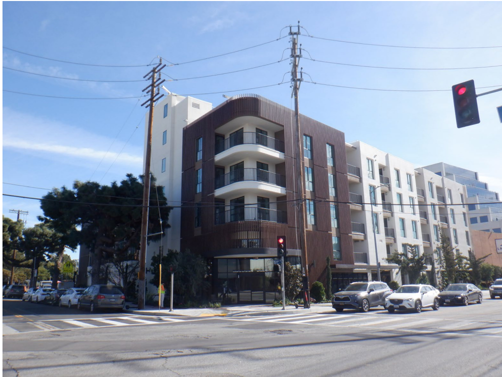
View from the corner of Missouri St. & Bundy.