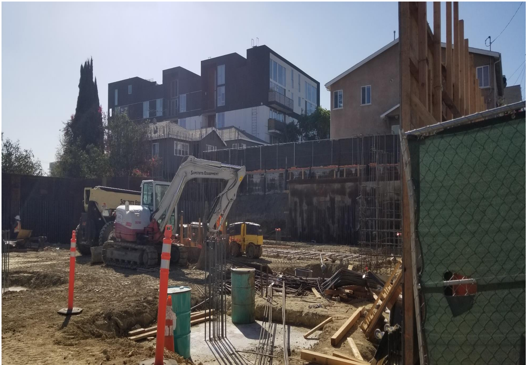
View from inside the fence at 418 Firmin St.