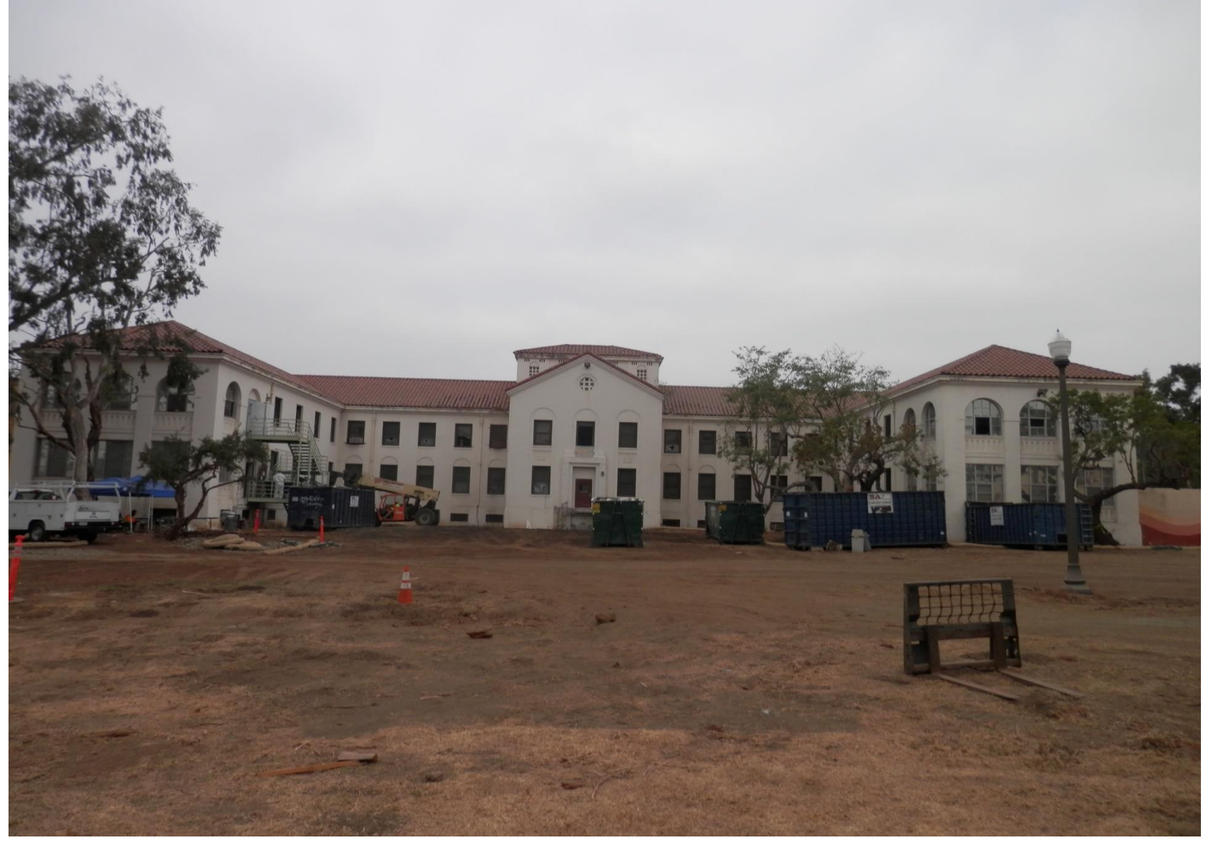
View from the Building 205 and Building 208 courtyard at 11301 Wilshire Blvd.