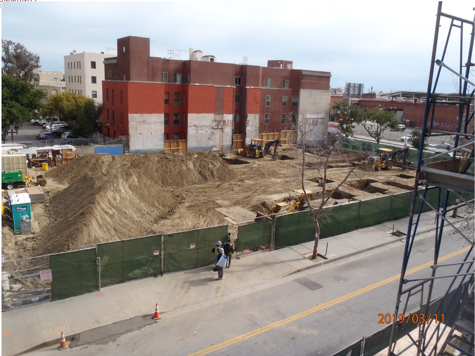
View from third floor 649 lofts .