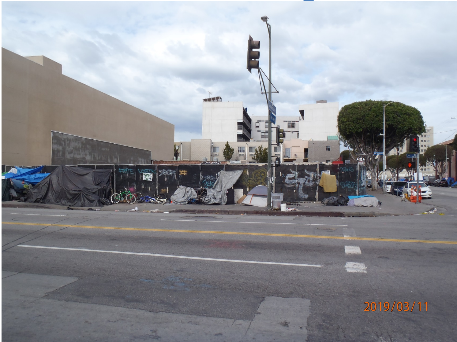
View from across the street at 7 th and San Pedro.