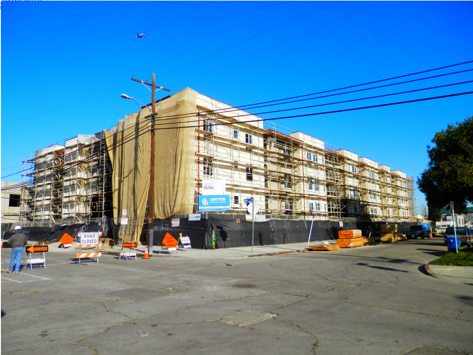
88 th and Vermont Apartments view from Menlo & 88 th