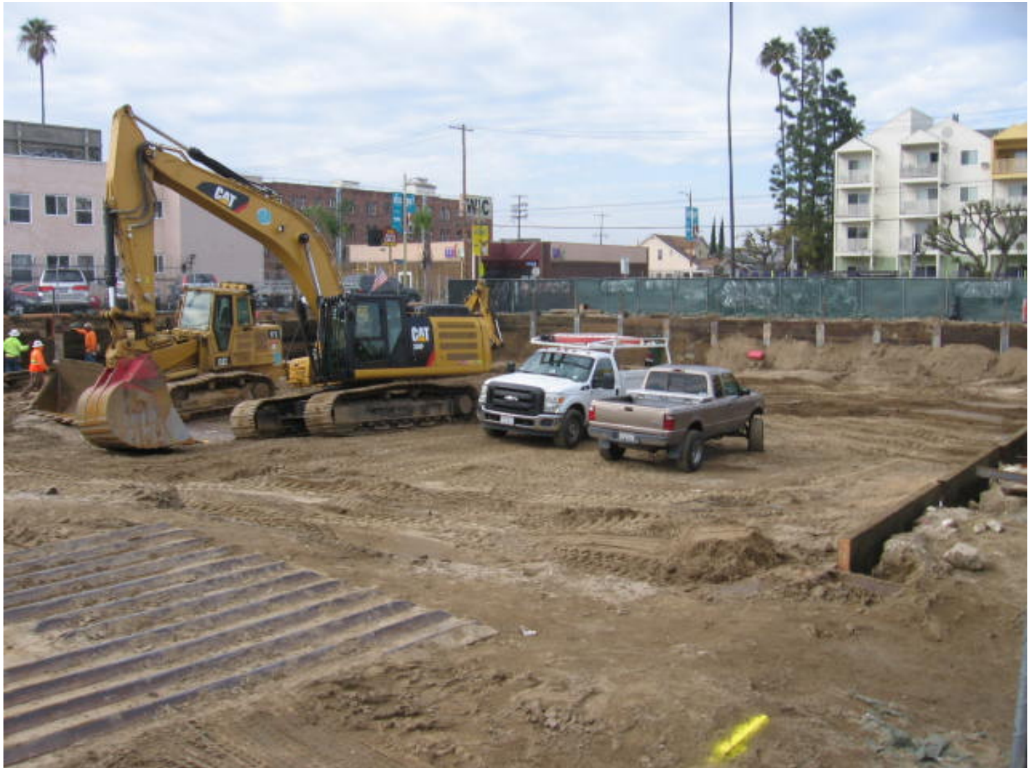
View from Figueroa and 40 th Pl. just inside fence 40 th Pl.