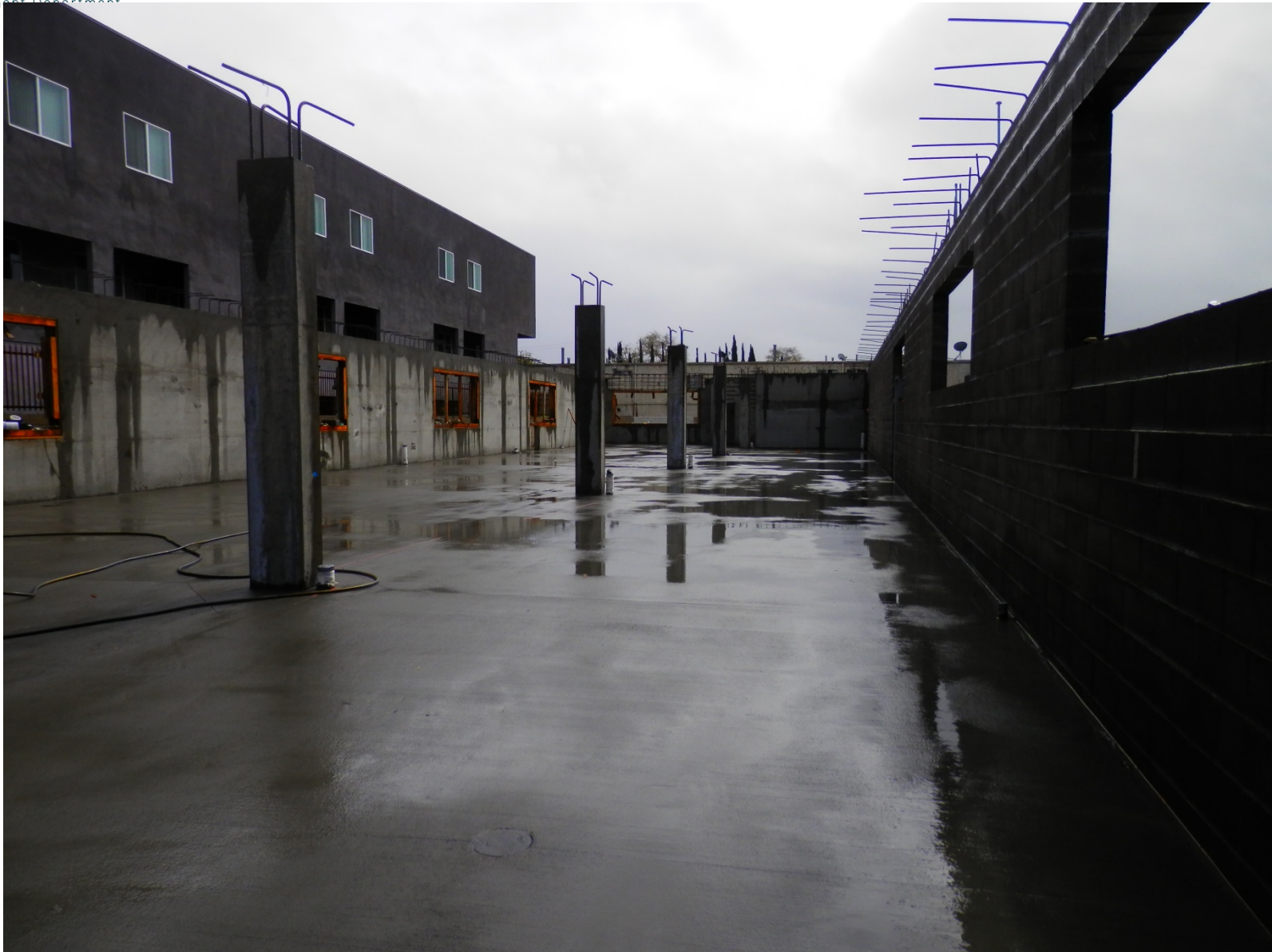
Casa del Sol view from just inside the sidewalk of situs.