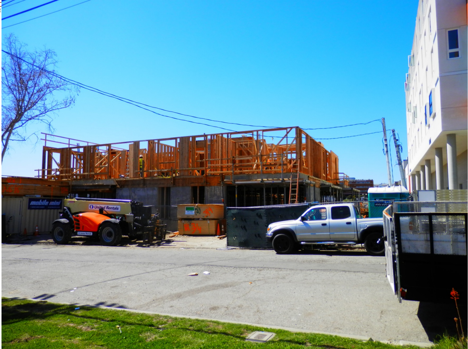
Path Metro PH 2. View from front of site at 343 Westmoreland Ave.