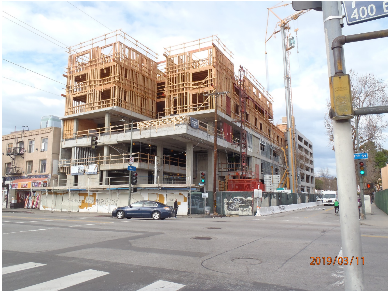
649 Lofts view from diagonal corner of 7 th & Wall St.