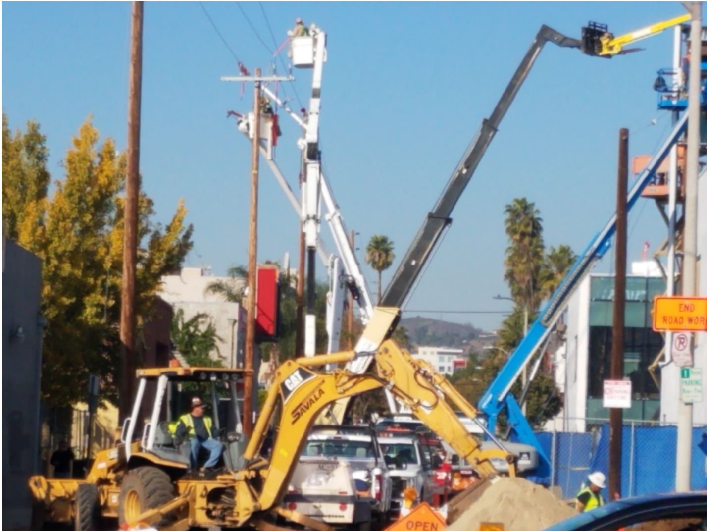
View from front of situs.