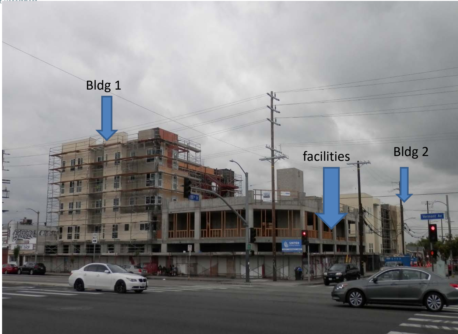
Located at 8707-27 S. Vermont. Building 1 & facilities view from 88th & Vermont.