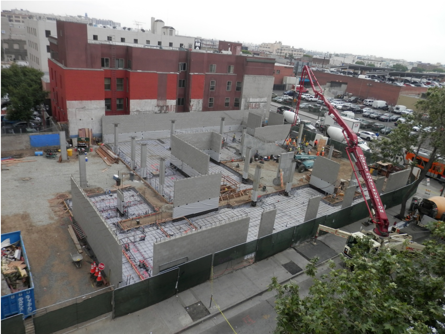
View from third floor 649 lofts