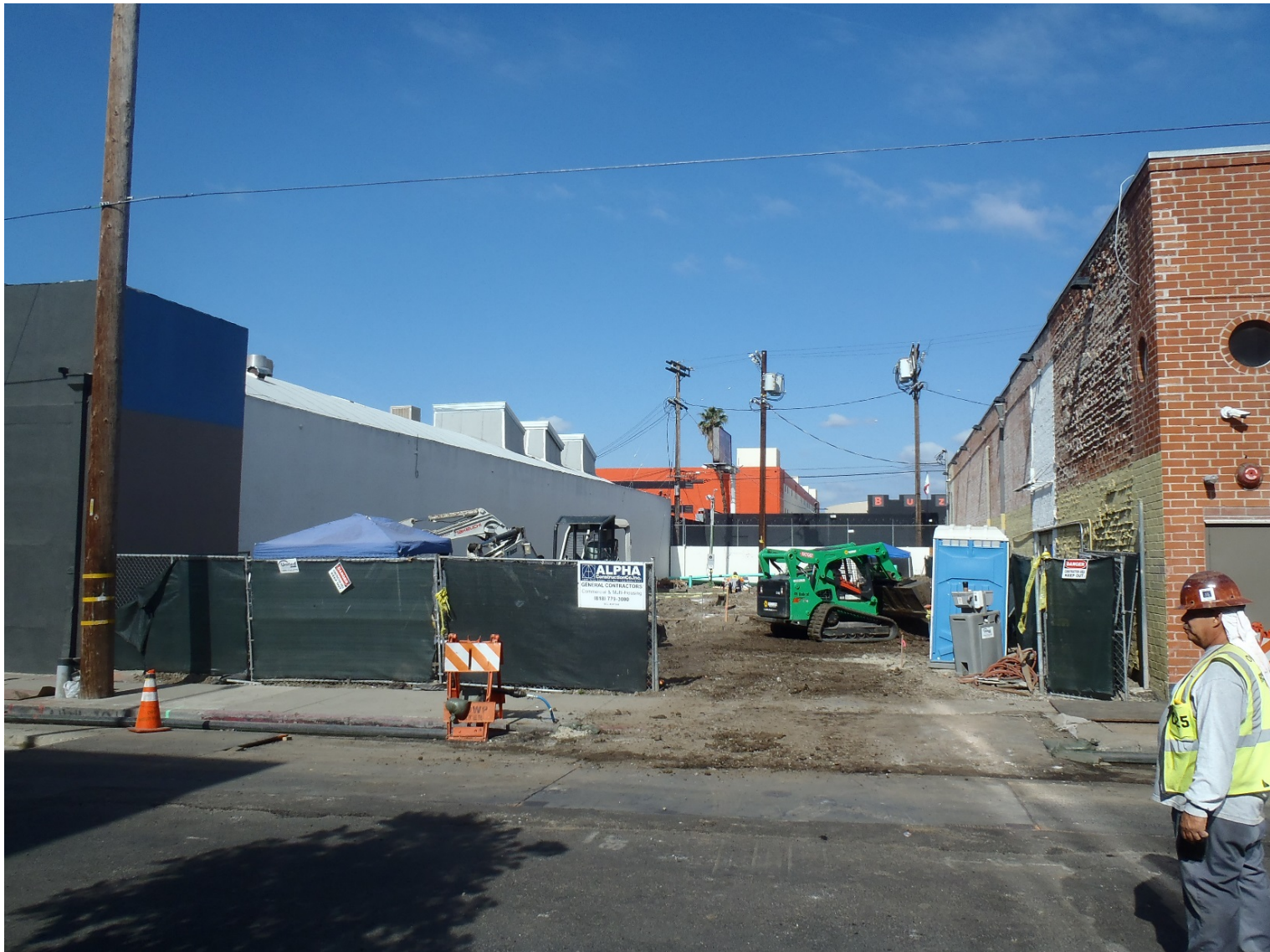
View from front of situs.