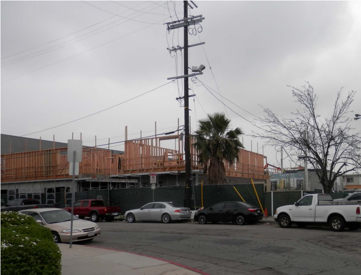
Casa del Sol view from across the street of situs.