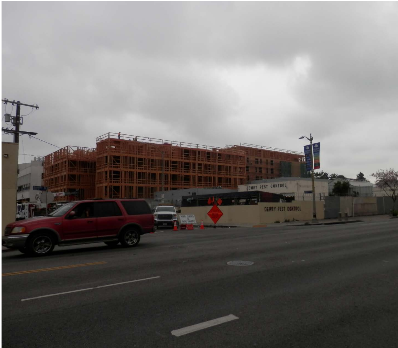
Path Metro Phase 2. View of site from Beverly & Madison Ave.