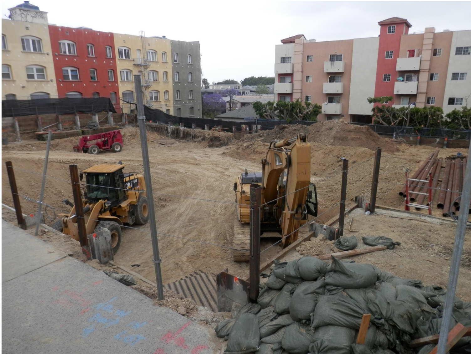
View from front of situs just inside the construction fence.