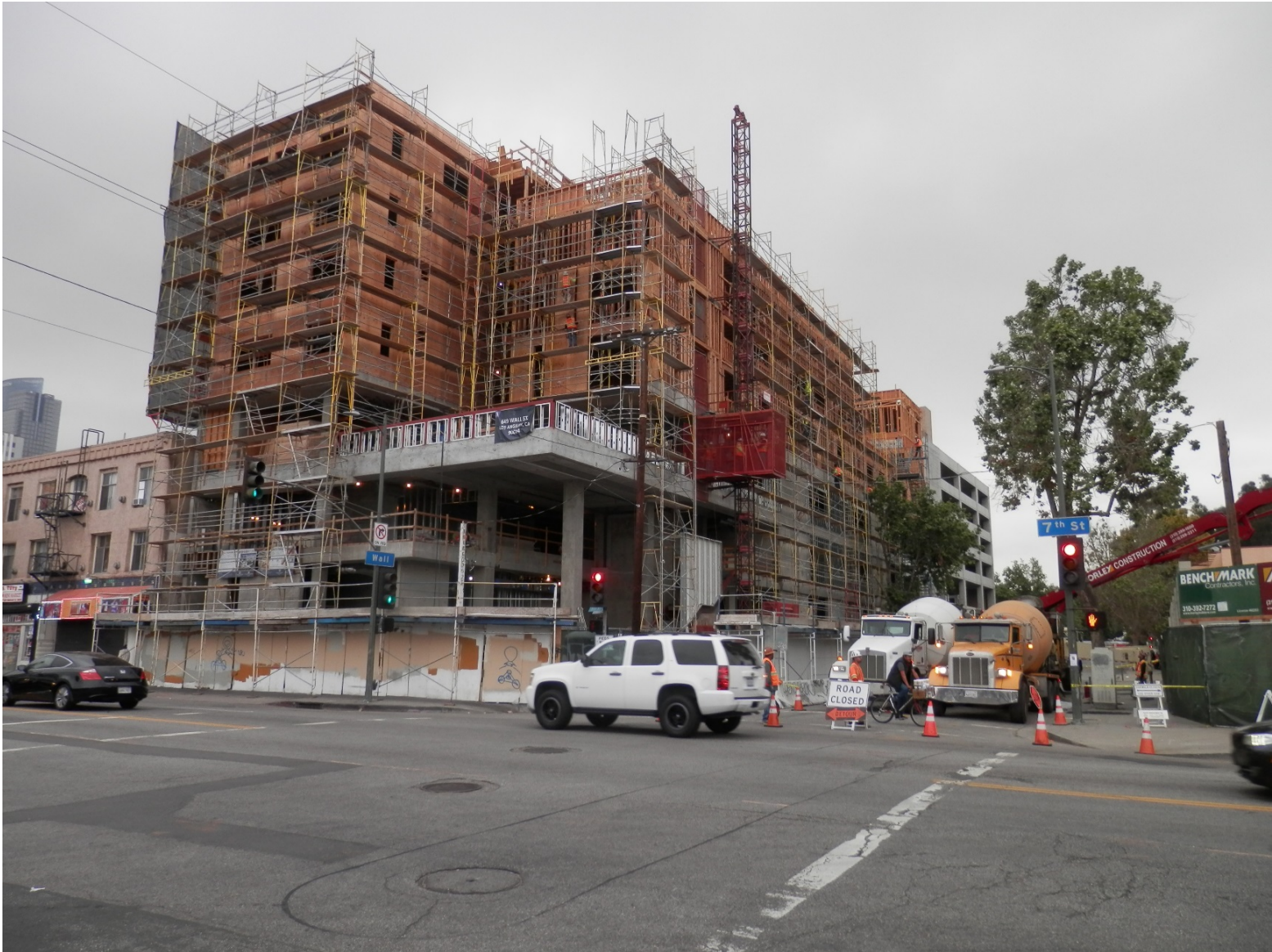
649 Lofts view from diagonal corner of 7 th & Wall St.