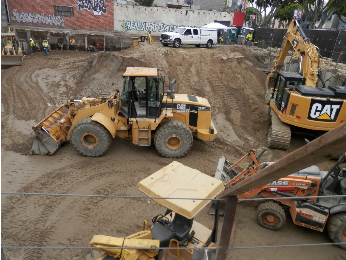
Located at 519 E 7 th St. View from just inside the construction fence on 7 th St.