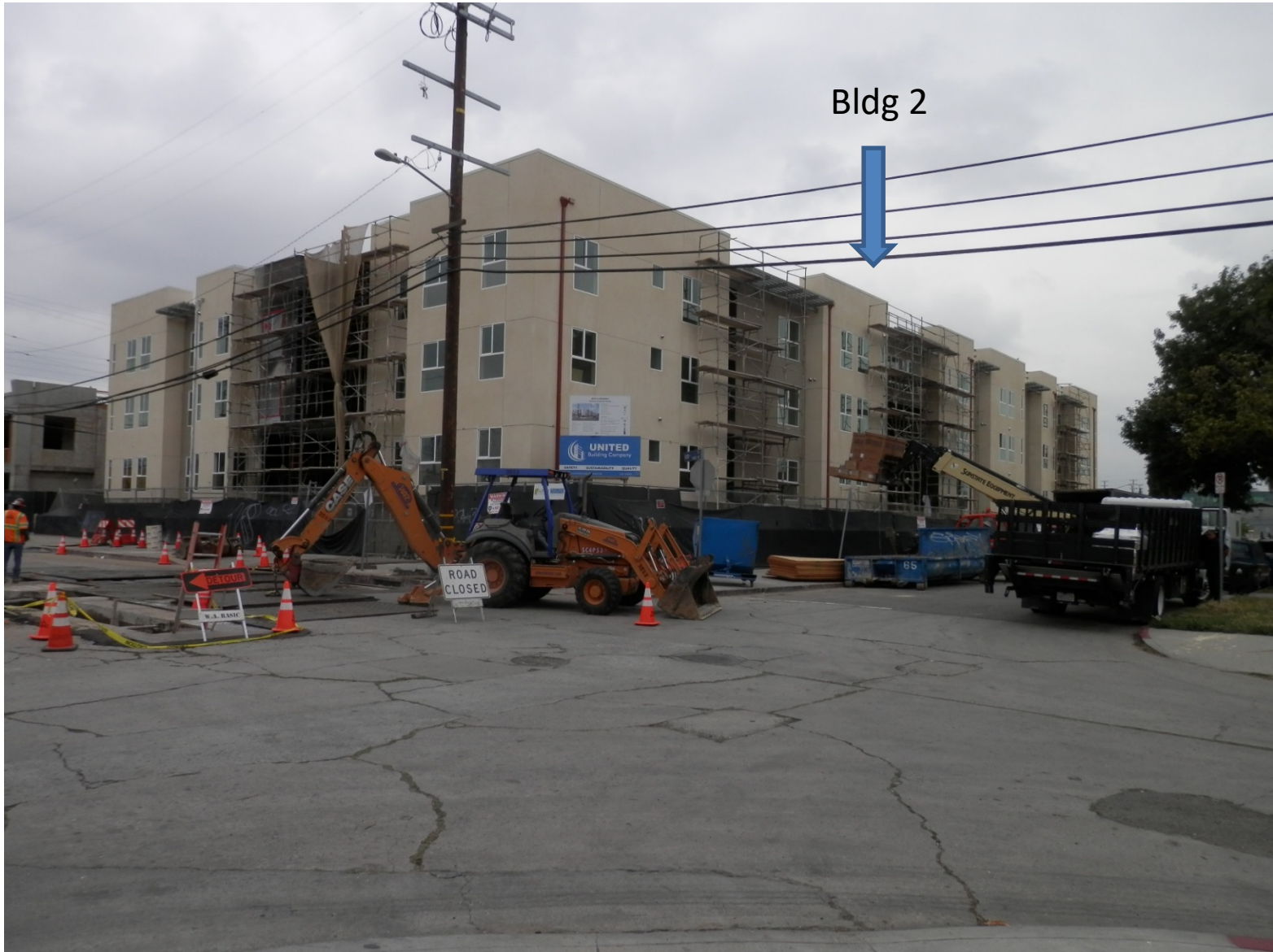
Located at 8707-27 S. Menlo Apts. Bldg 2 residential . View from Menlo & 88 th