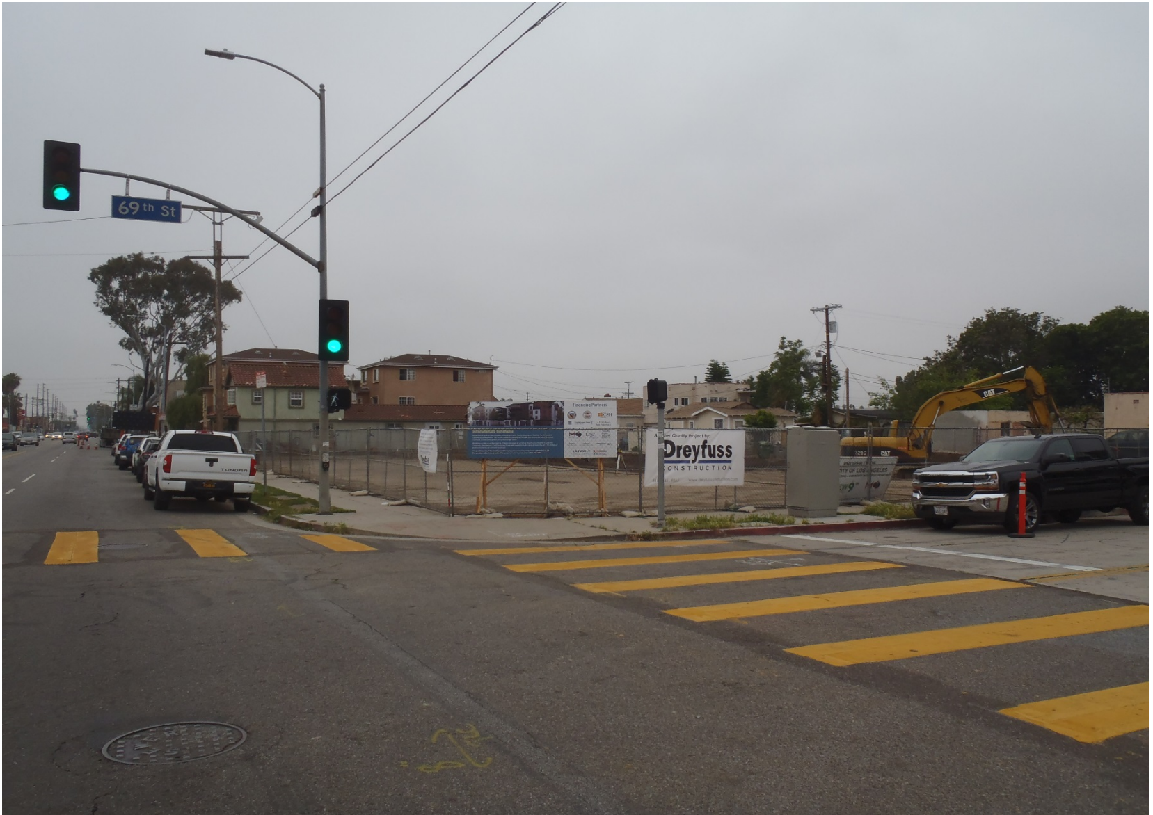
View from Main & 69 th St. .