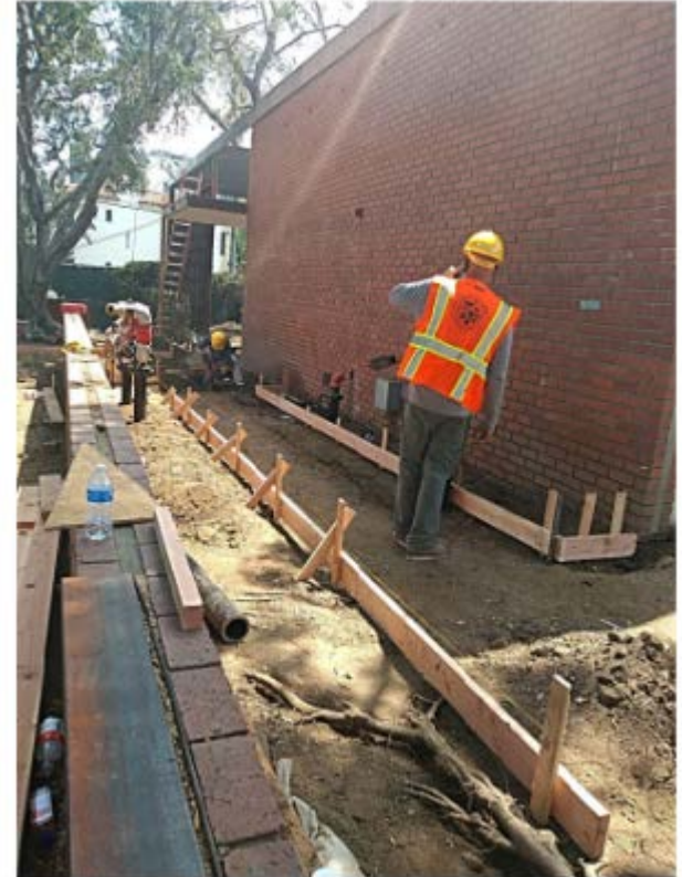
Retrofit and painting of original outdoor structure; trenching