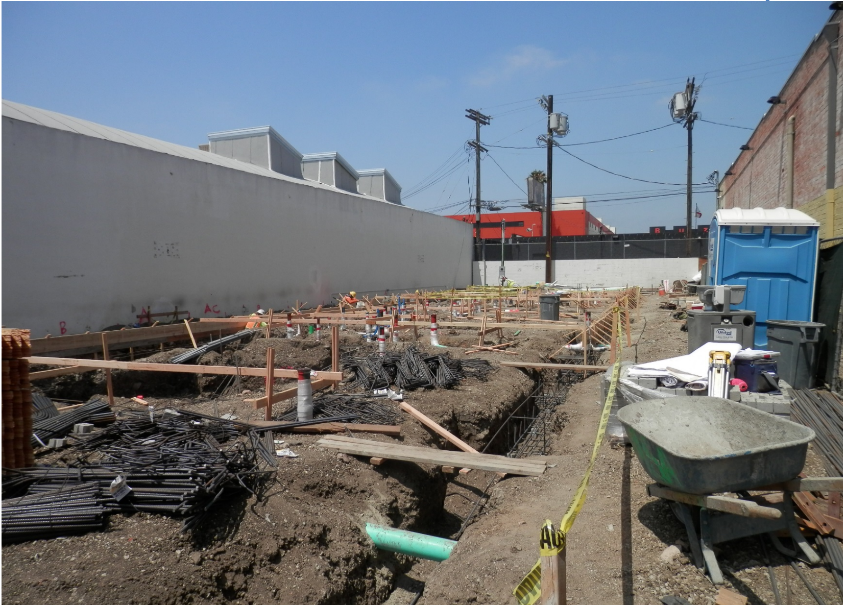
Located at 1119 N. Mc Cadden Pl. . View from just inside of fence of situs.