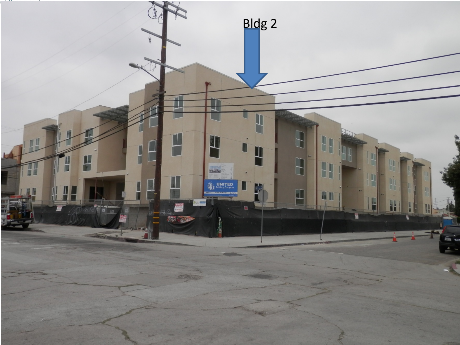
Located at 8707-27 S. Menlo Apts. Bldg 2 residential . View from Menlo & 88 th