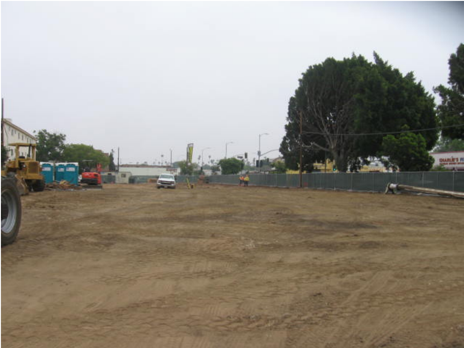
View from just inside the fence at Washington & Gramercy. .