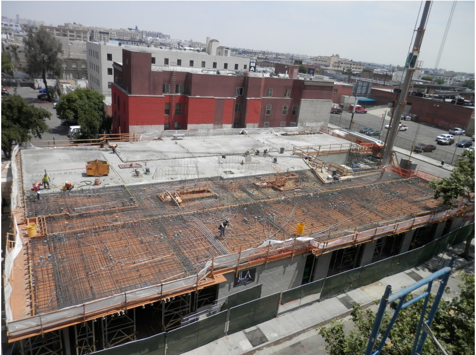
Located at 401 E 7 th St. . View from third floor of 649 lofts across Wall St .