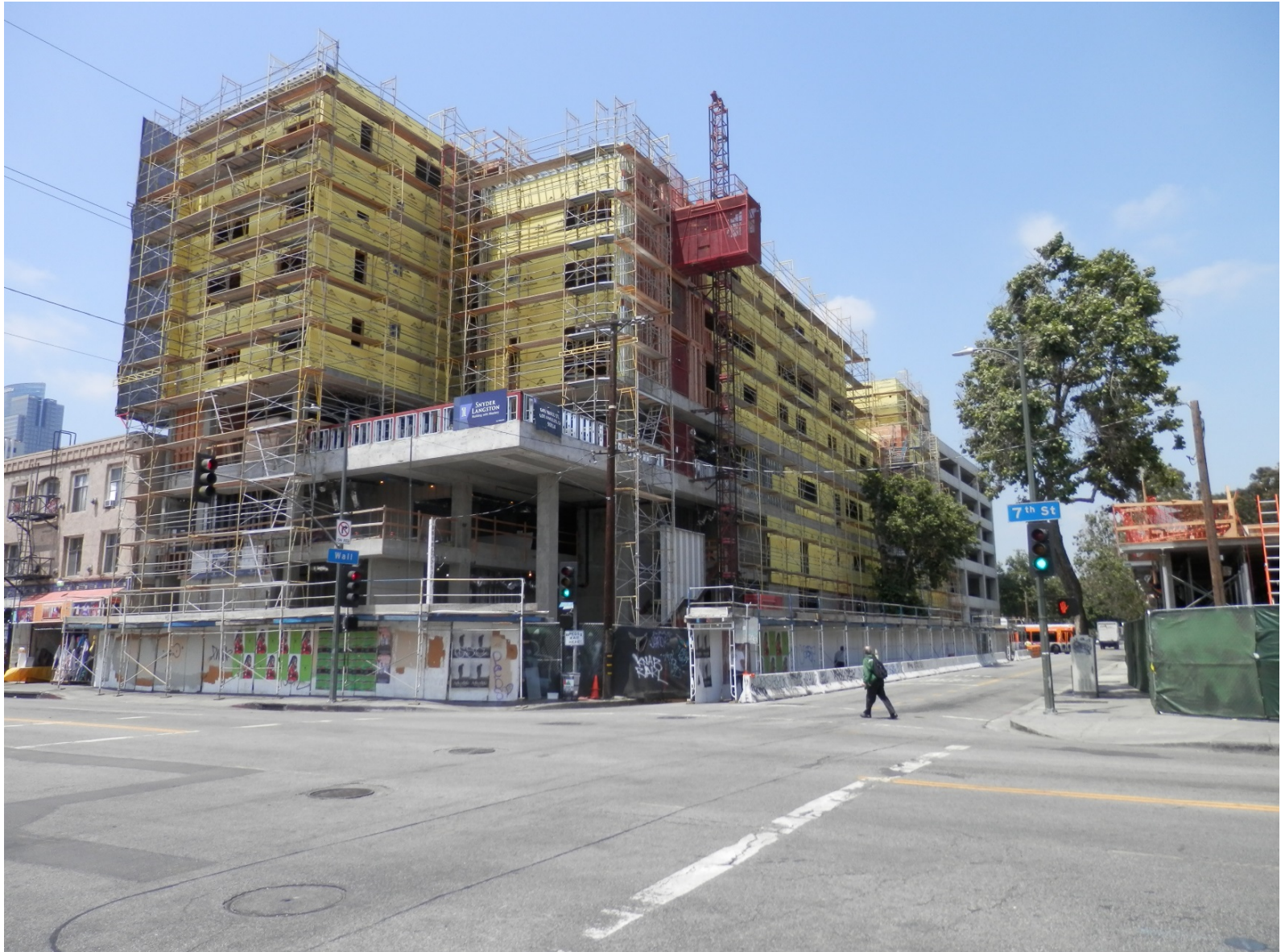
Located at 649 S. Wall St. View from diagonal corner of 7 th & Wall St.