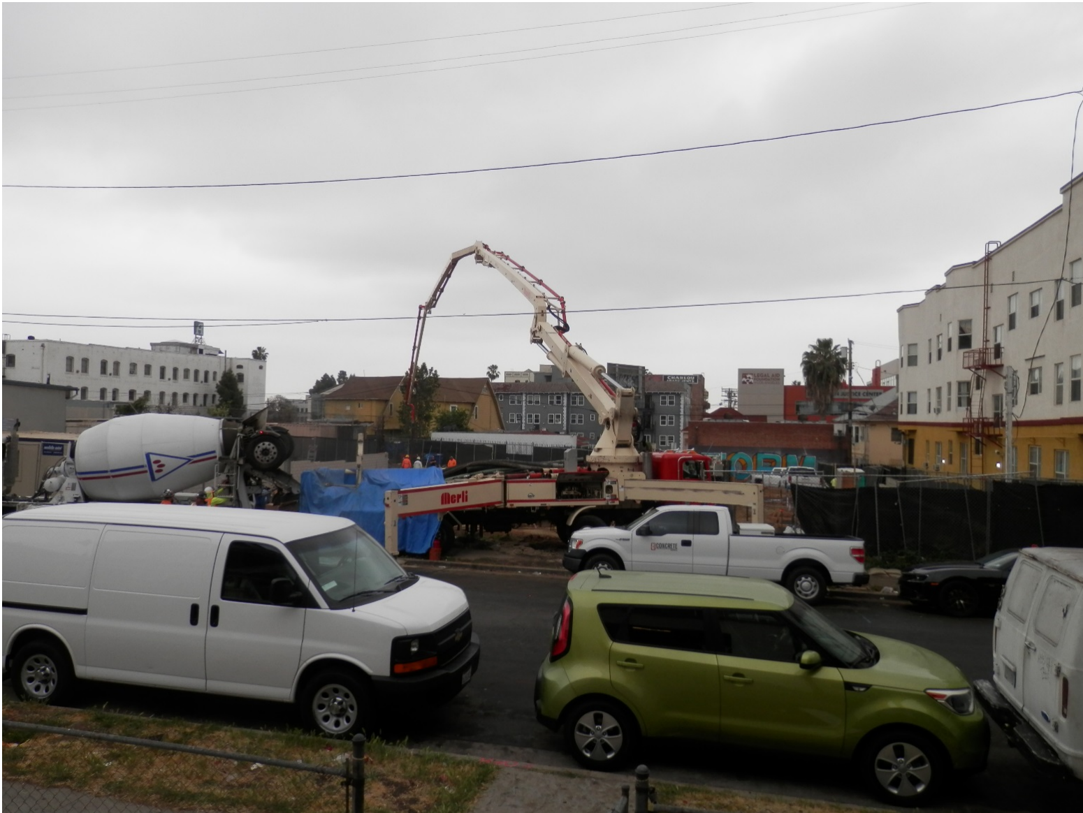
Located at 1532-38 Cambria St.. View from across the street of situs.