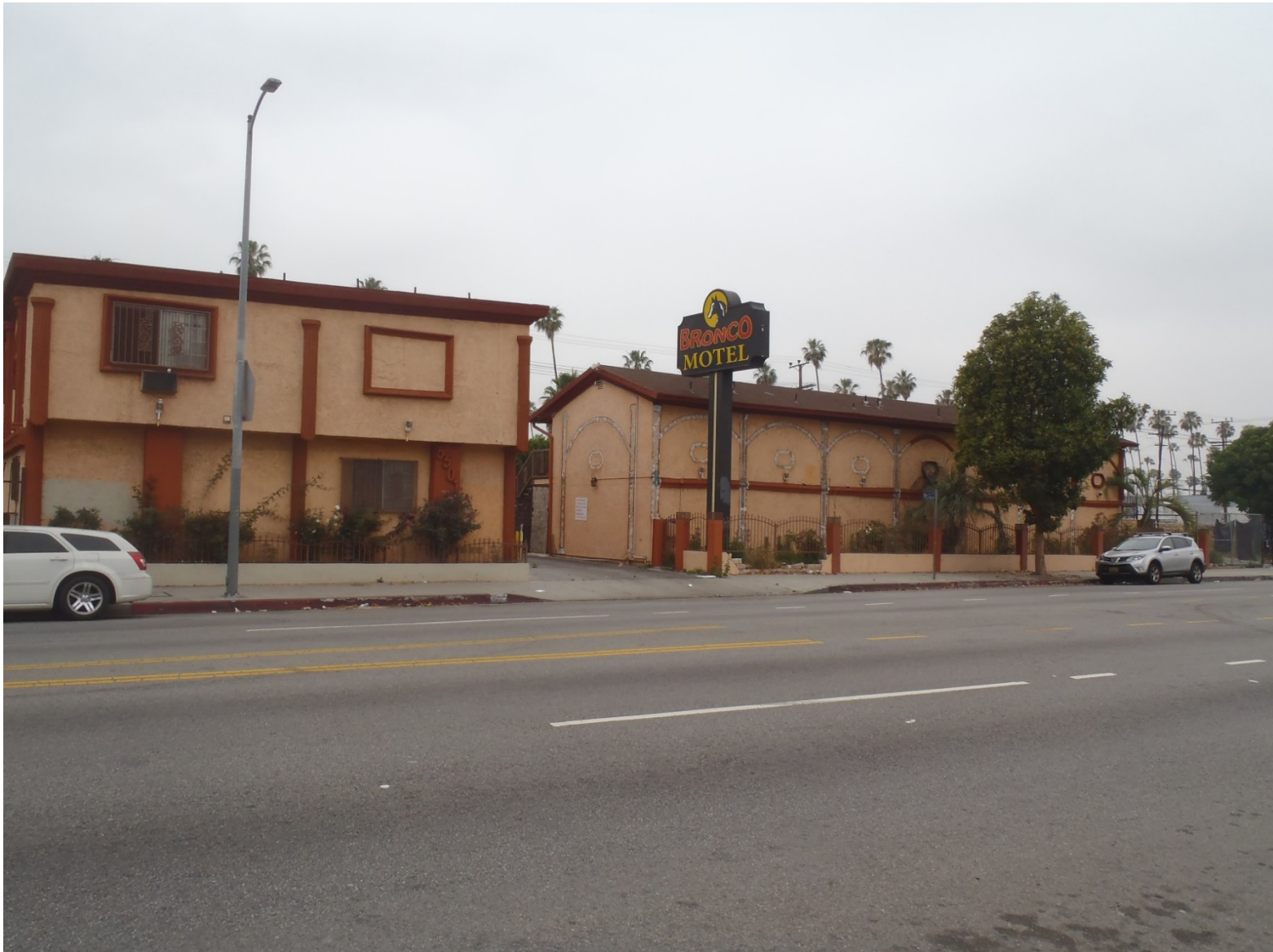
View from across situs at 5501 S. Western Ave. .