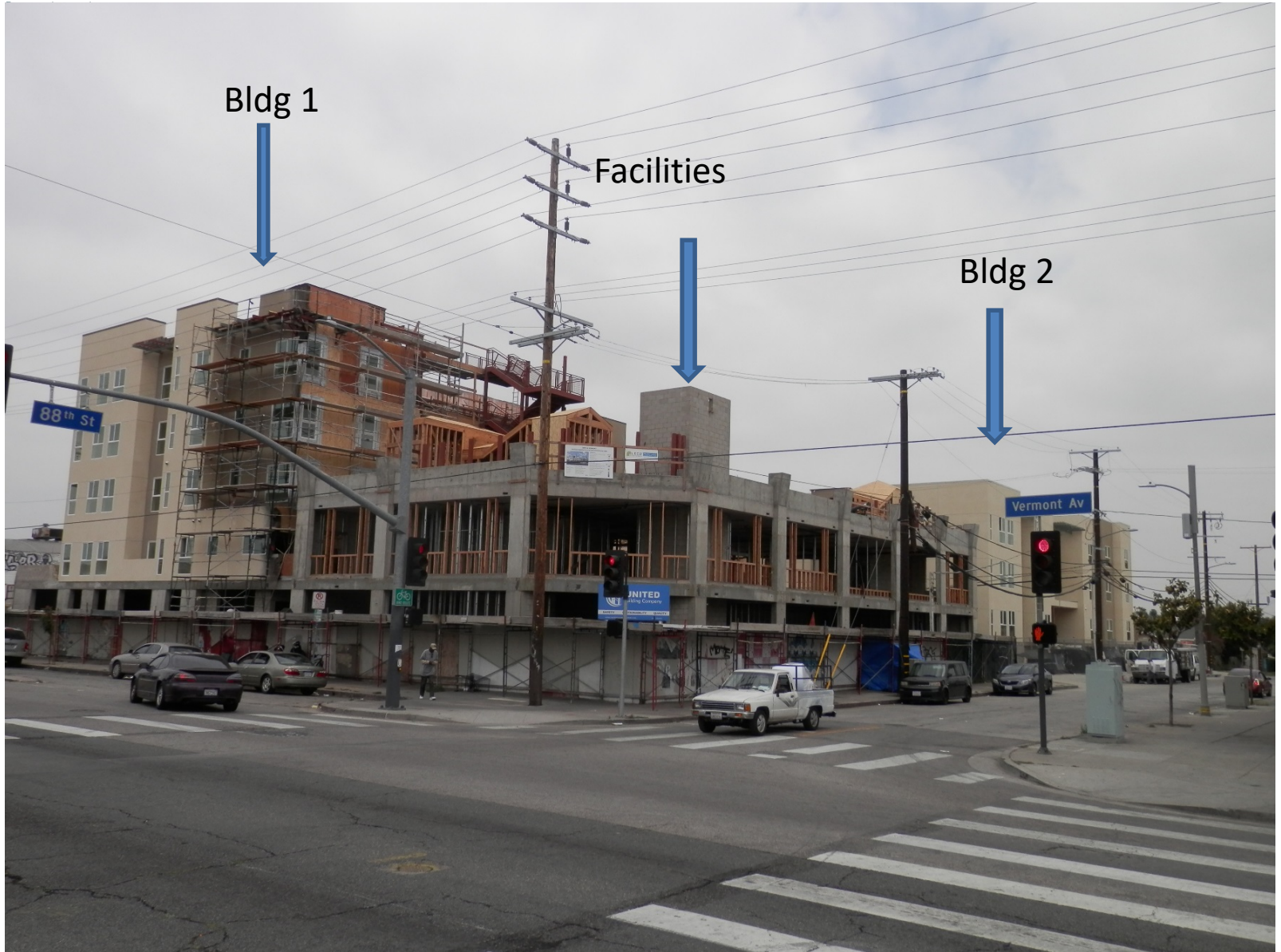
Located at 8707-27 S. Vermont. Building 1 & facilities view from 88th & Vermont.