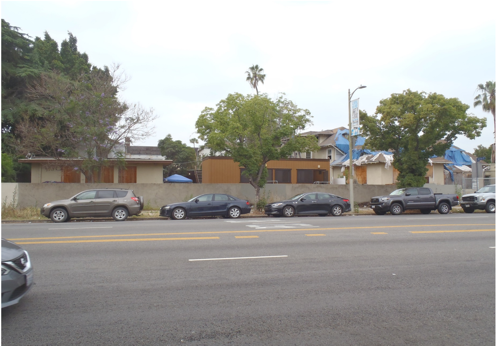
View from across the street on Adams St. & Hoover .