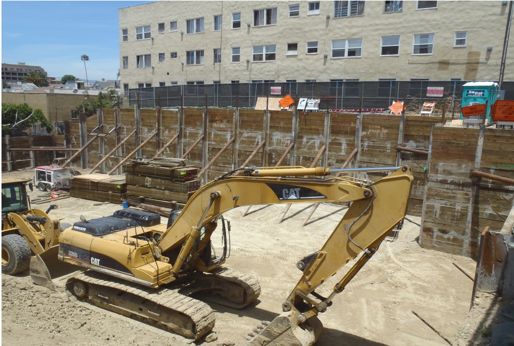
View from just inside fence at 445 S. Harford Ave.