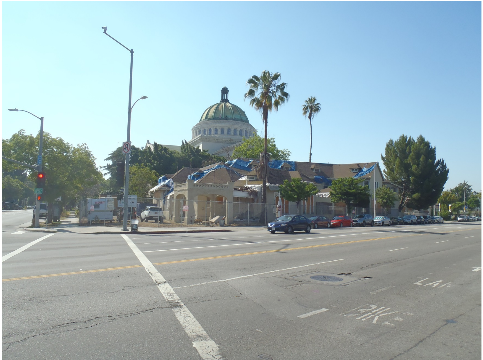
View from across the street on Adams St. & Hoover .