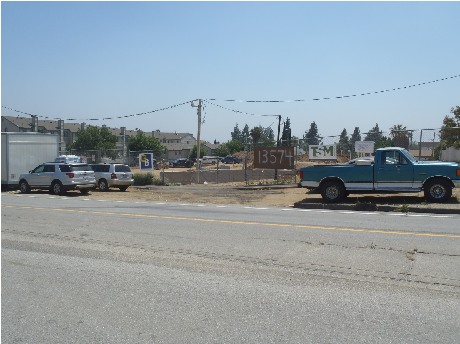
View from across situs at 13574 Foothill Blvd. .