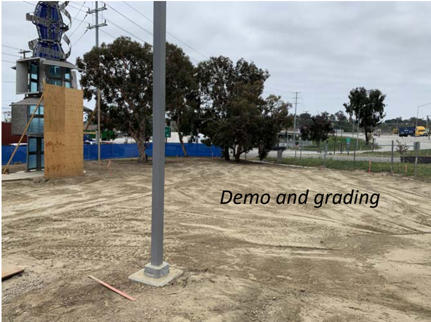
Demo and grading