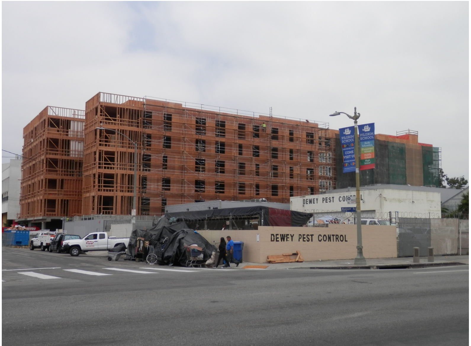
Path Metro PH 2. View of site at corner of Beverly Blvd & Madison Ave.