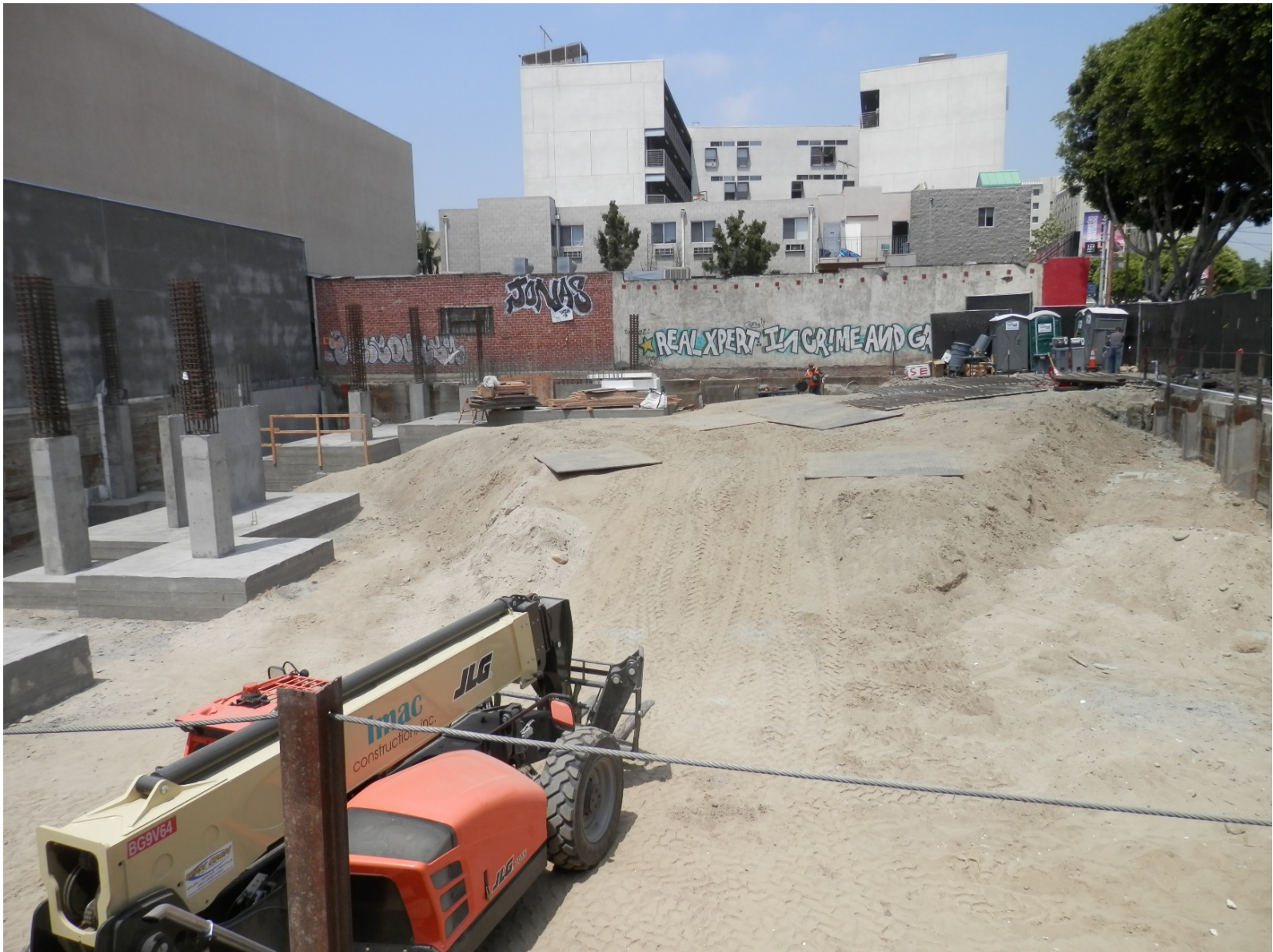
Located at 519 E 7 th St.. View from just inside the construction fence on 7 th St.