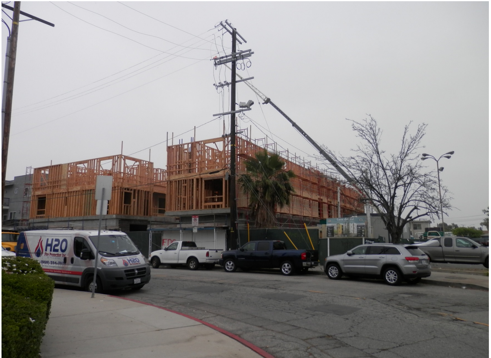
Located at 10966 Ratner St.. View from across street of situs.