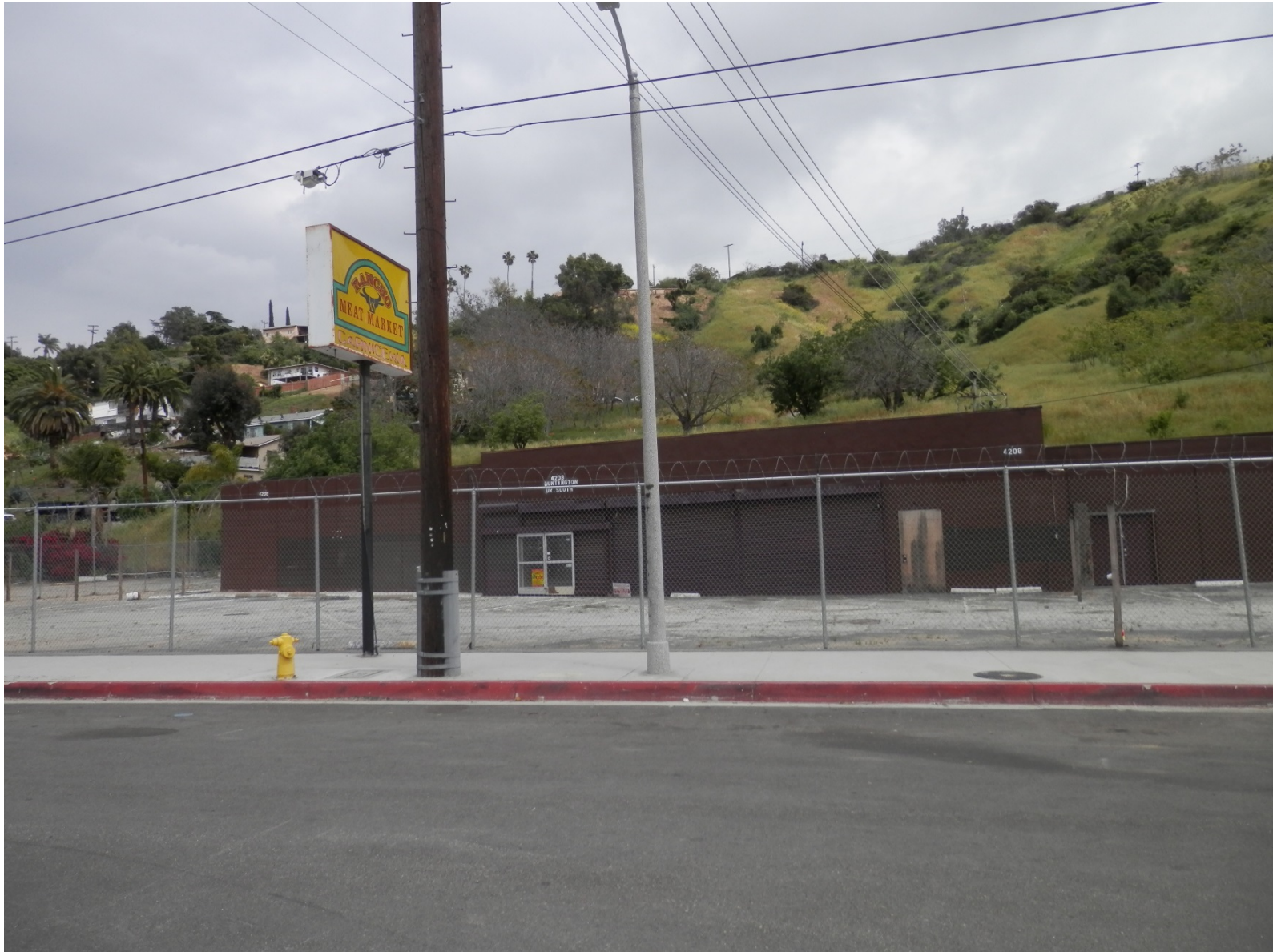
View from across situs at 4208 E Huntington Dr. South