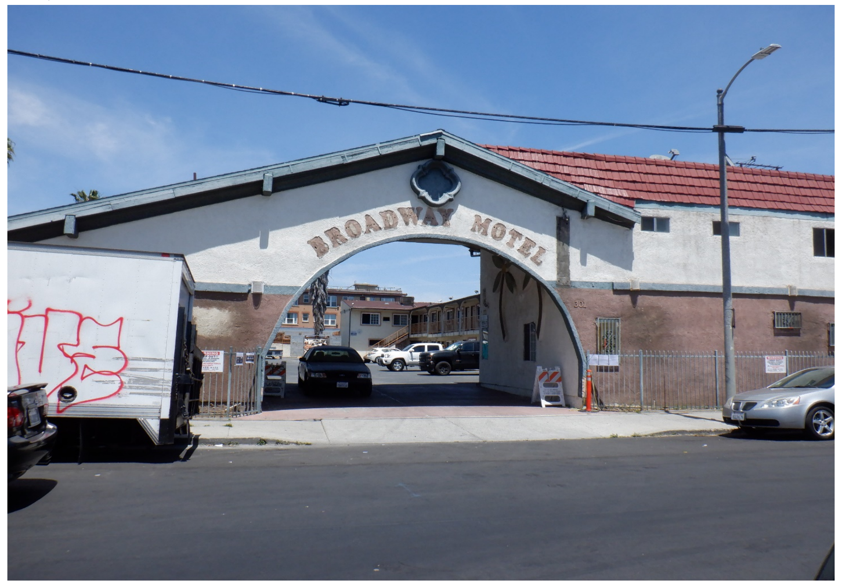
View from across the street at 301 W 49th St.