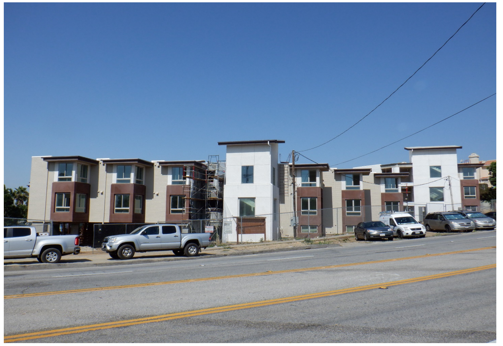
View of the two buildings from front of the site at 13574 Foothill Blvd.