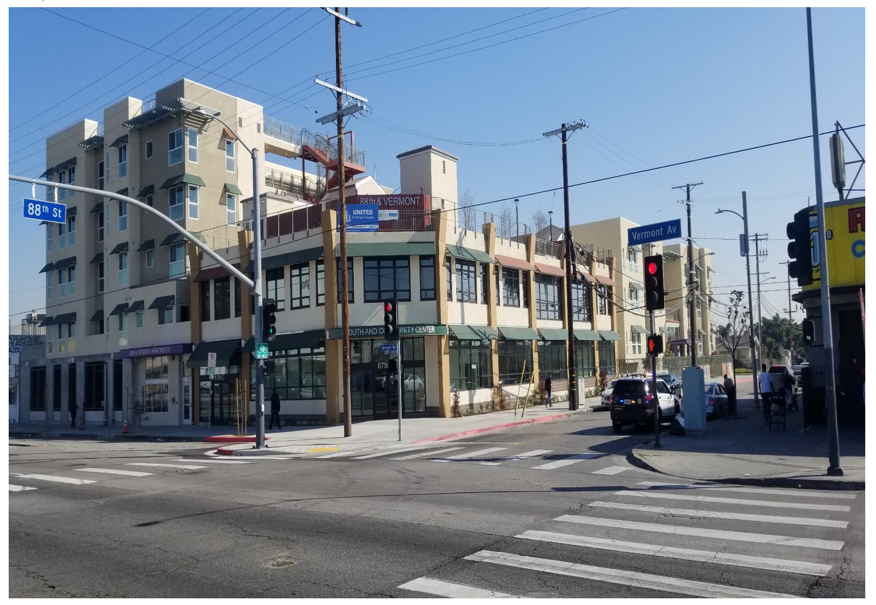
Located at 8707-27 S. Vermont. Building 2 & facilities view from 88th & Vermont.