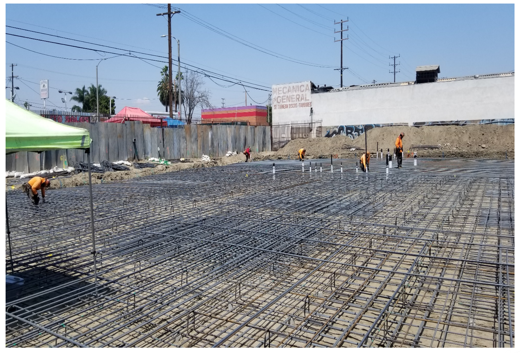
View from across the street at Florence Ave & Towne.