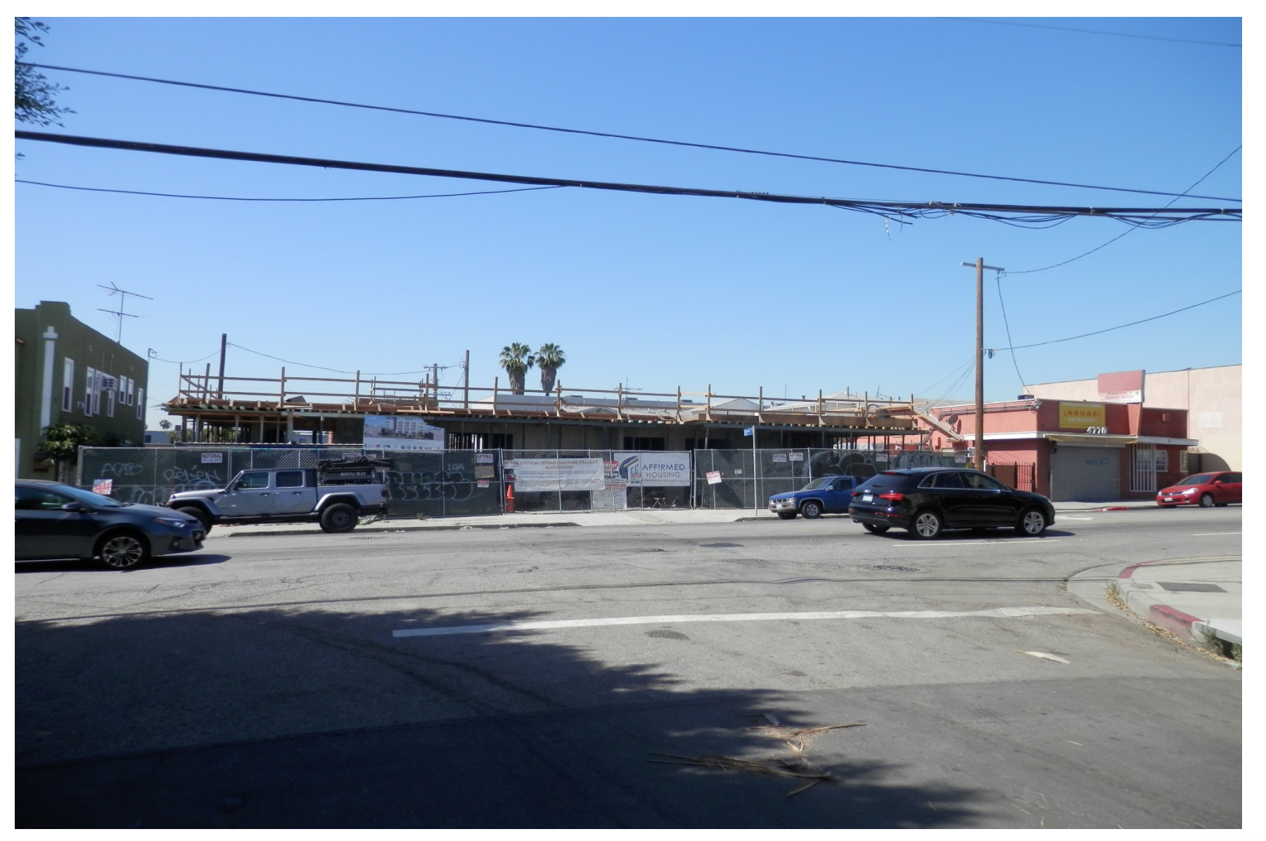
View from across the street at 4760 Melrose Ave.