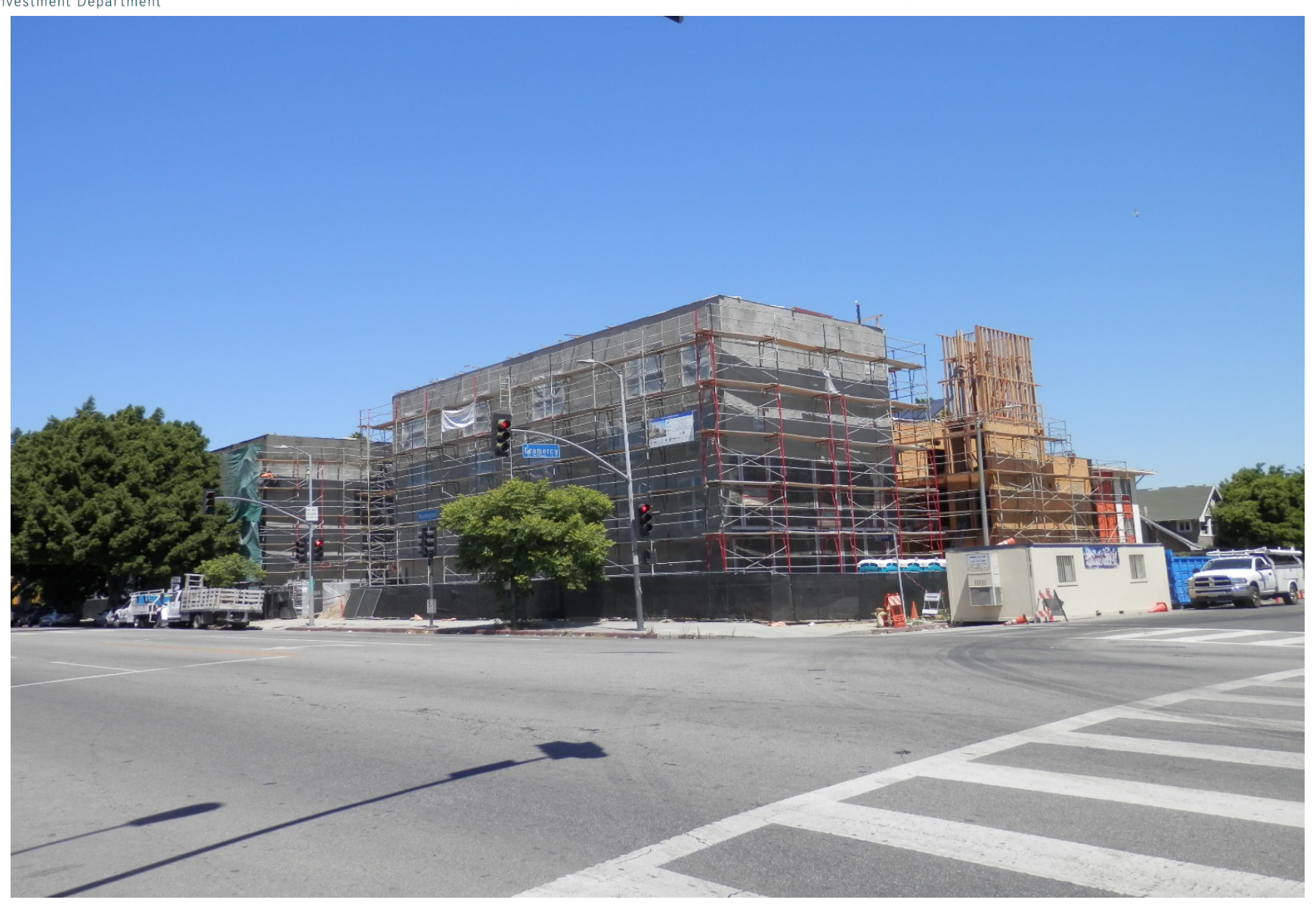
Street view from corner of Washington & Gramercy.