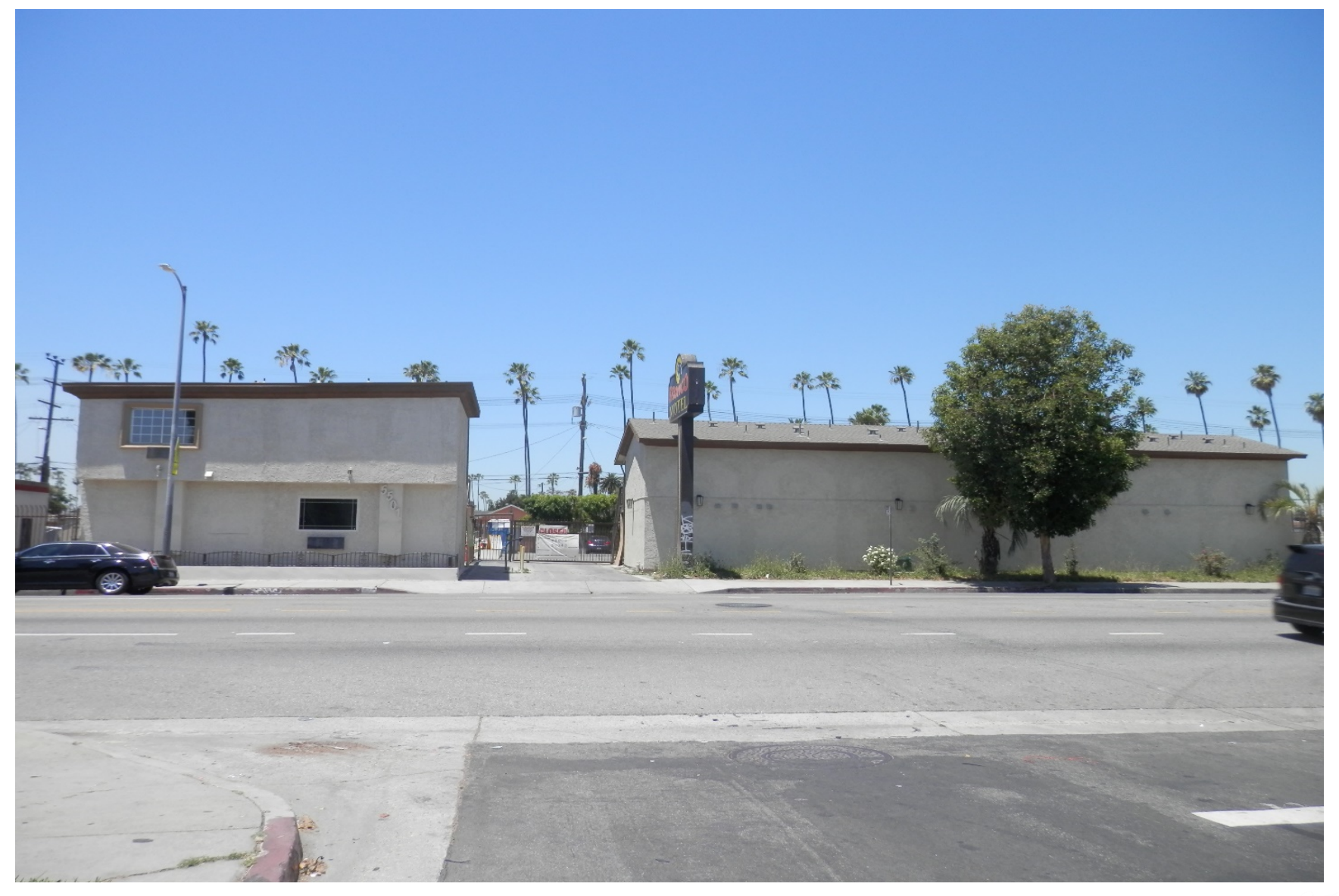
View from across site at 5501 S. Western Ave.