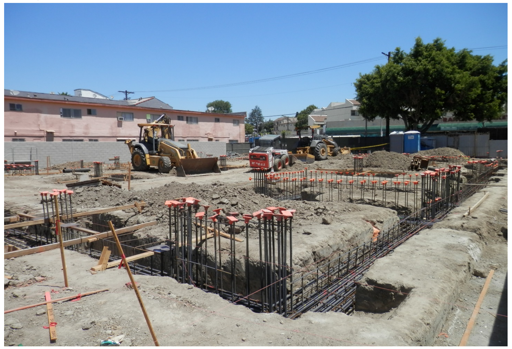
View from across the street at 4220 Montclair St.