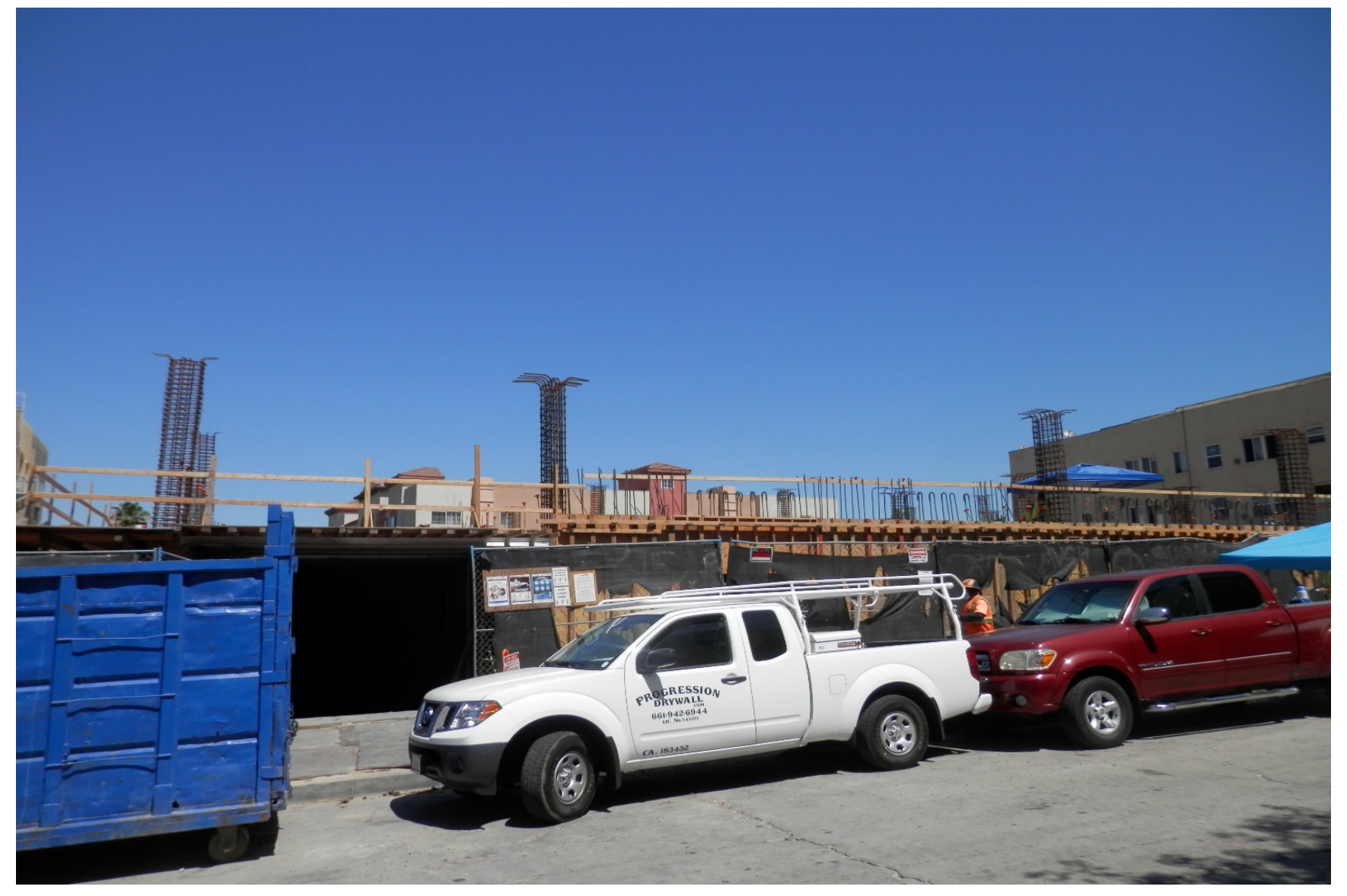
View from across the street at 445 S. Harford Ave.