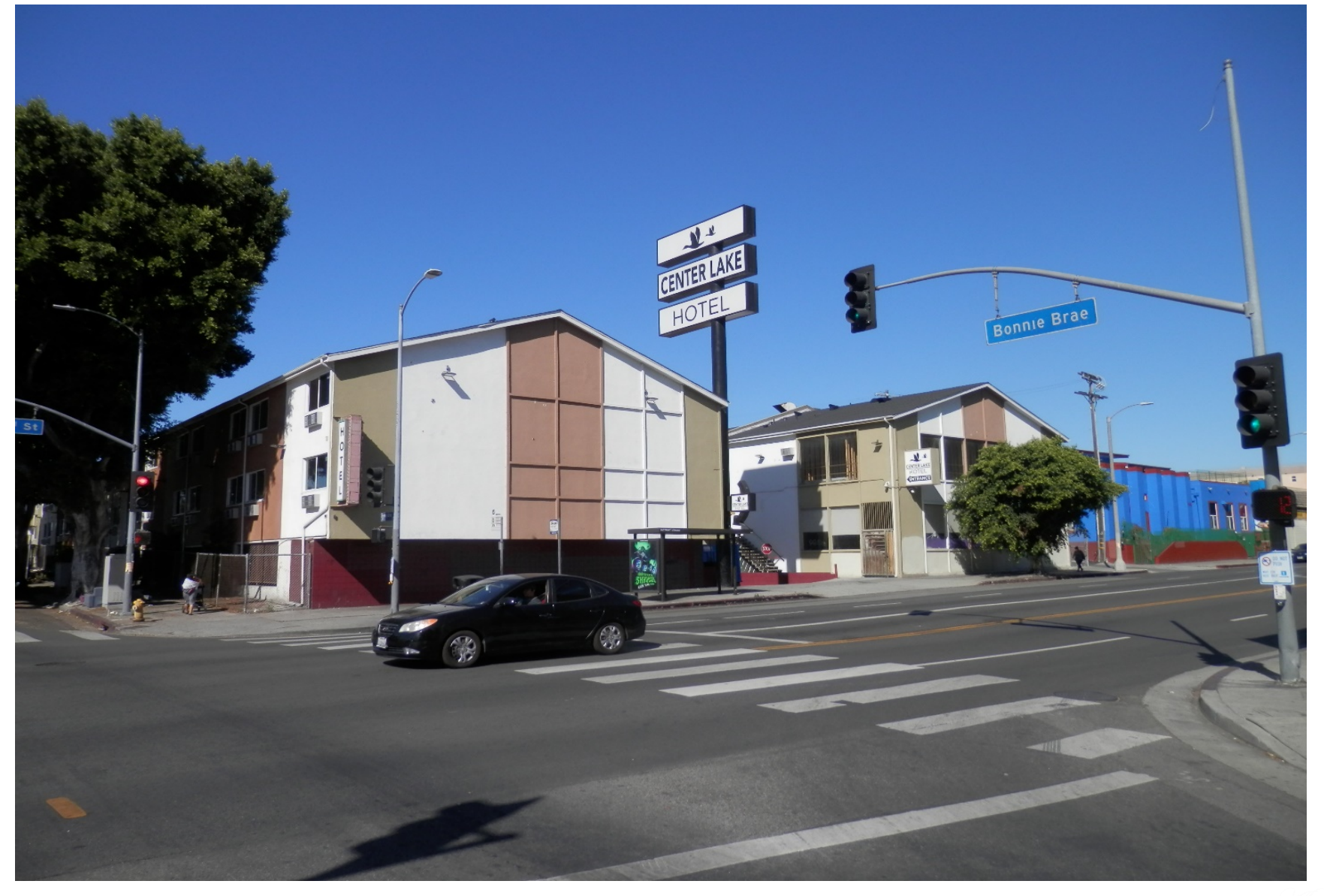
View from across the street at 1906 W 3<sup>rd</sup> St.