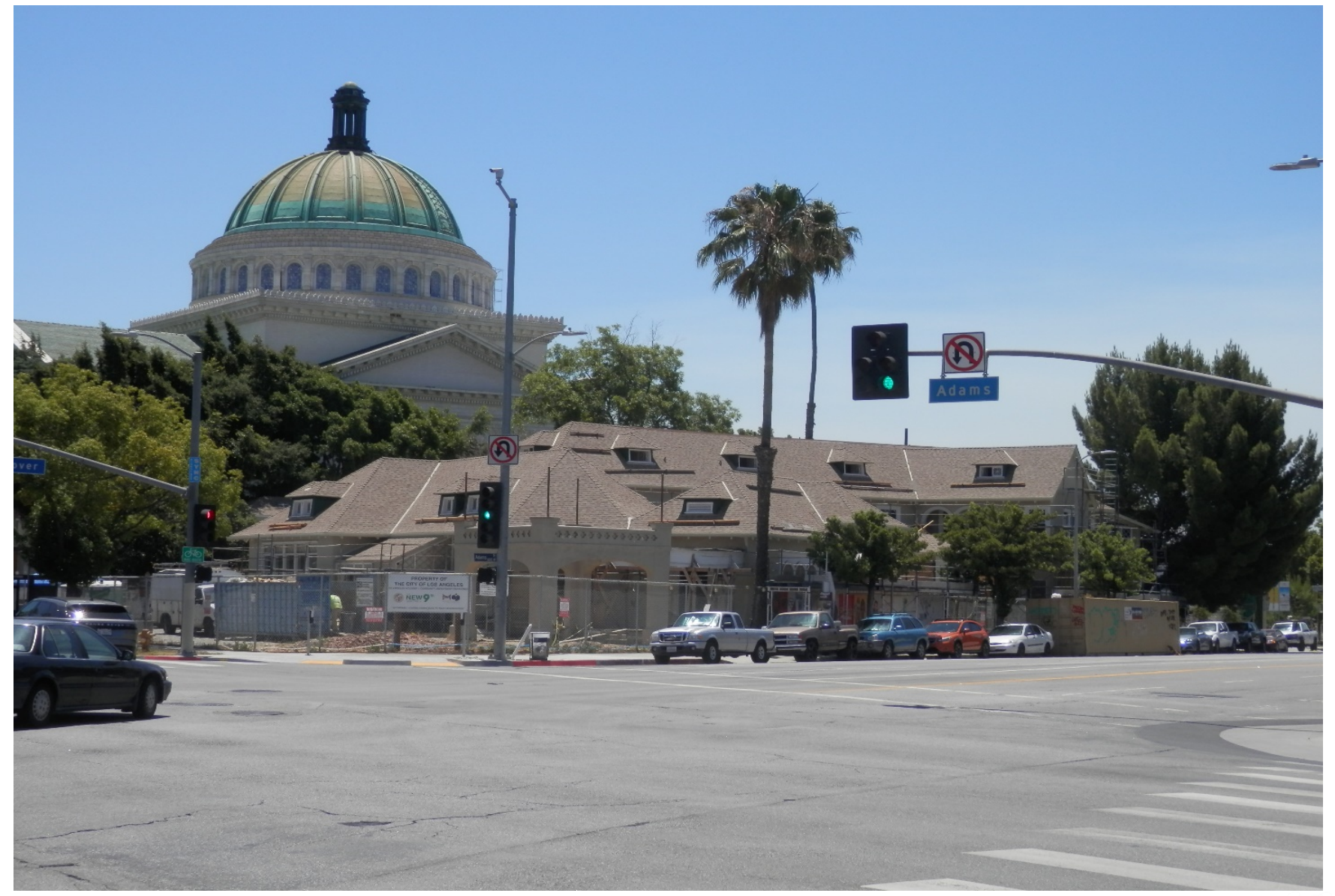
View from across the street on Adams St. & Hoover.