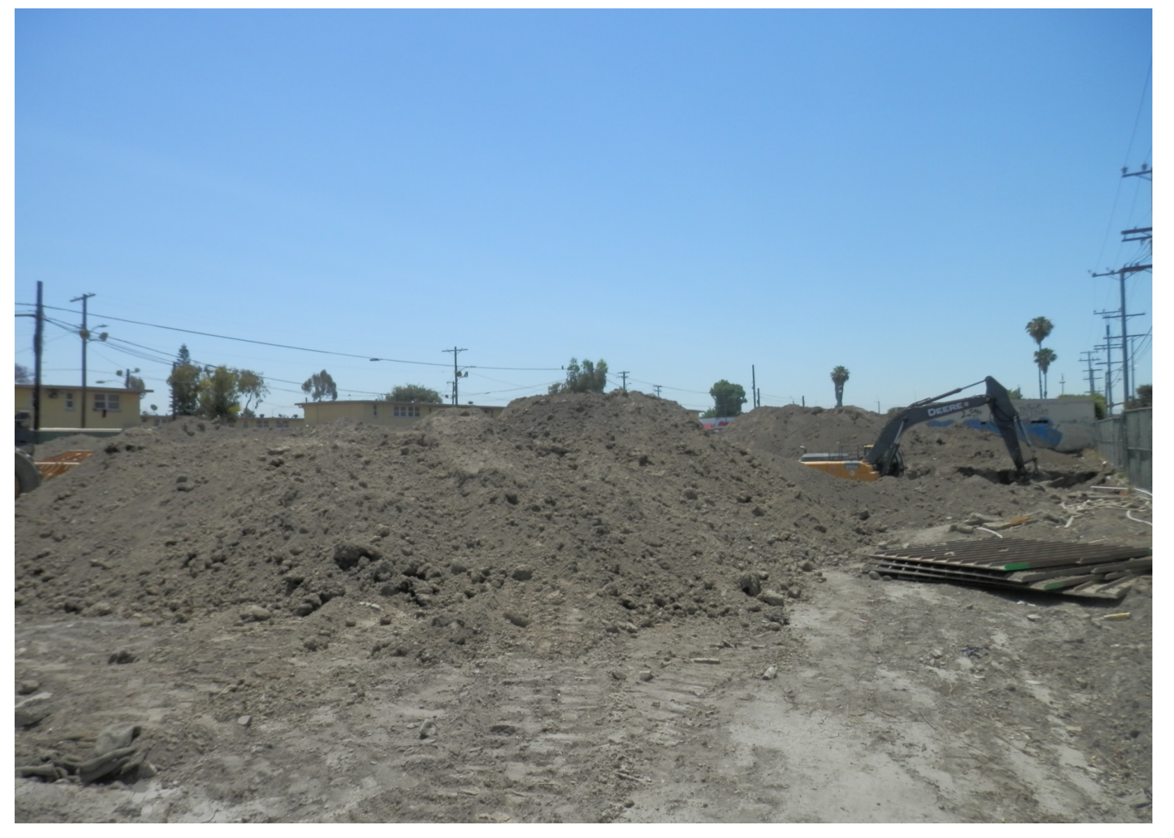
View from just inside the fence at 11408 S Central Ave.