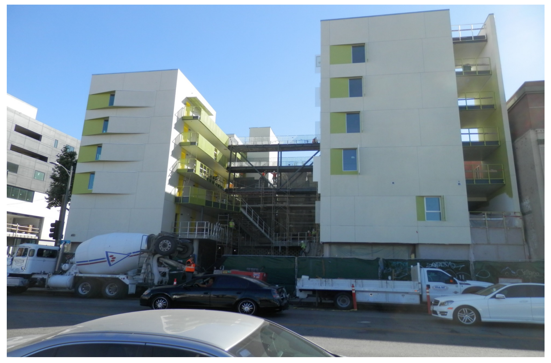
Located at 401 E 7<sup>th</sup> St. View from across the street of 401 E. 7<sup>th</sup> St.