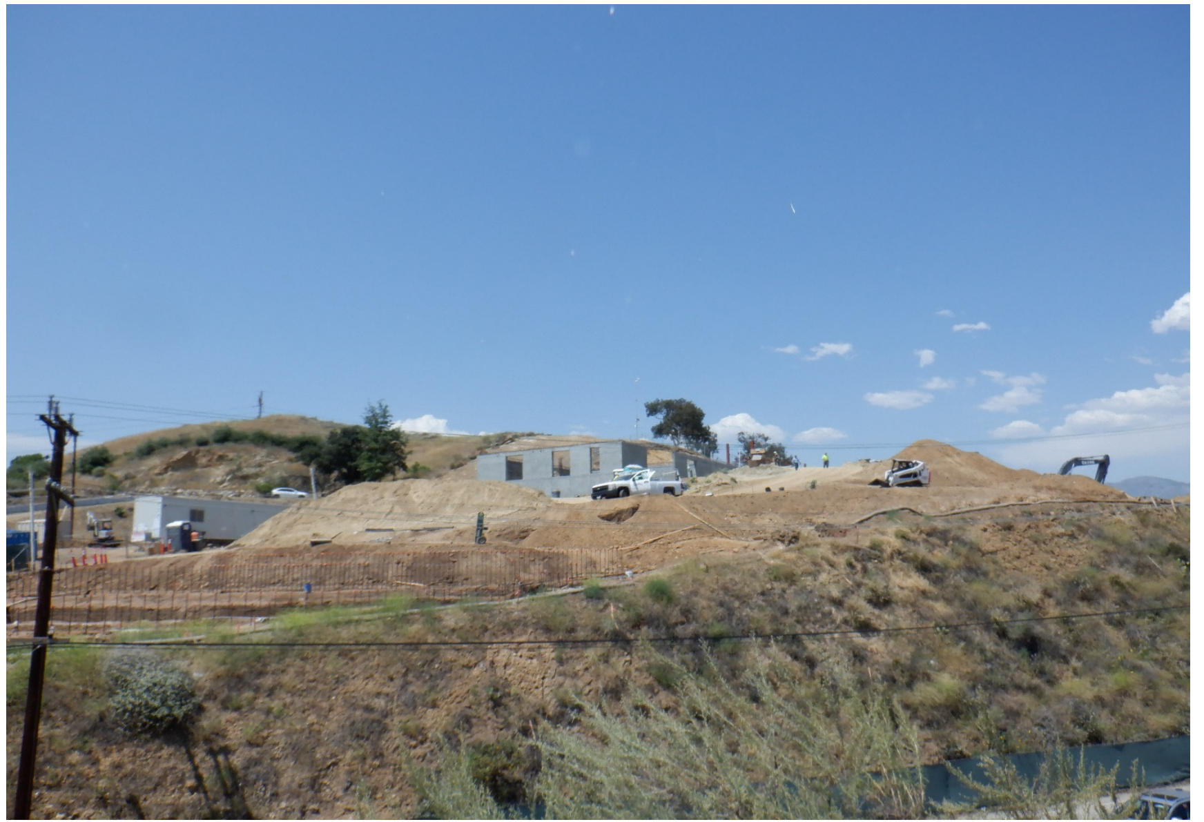
View from across the street at 11681 Foothill Blvd.