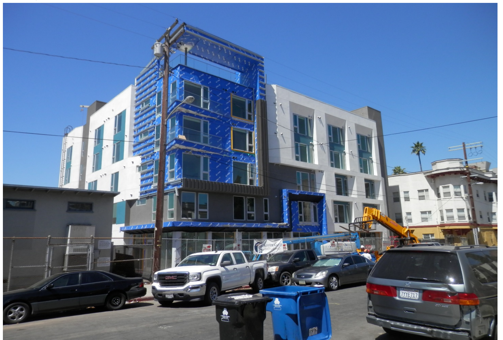
Located at 1532-38 Cambria St. View from across the street of site.