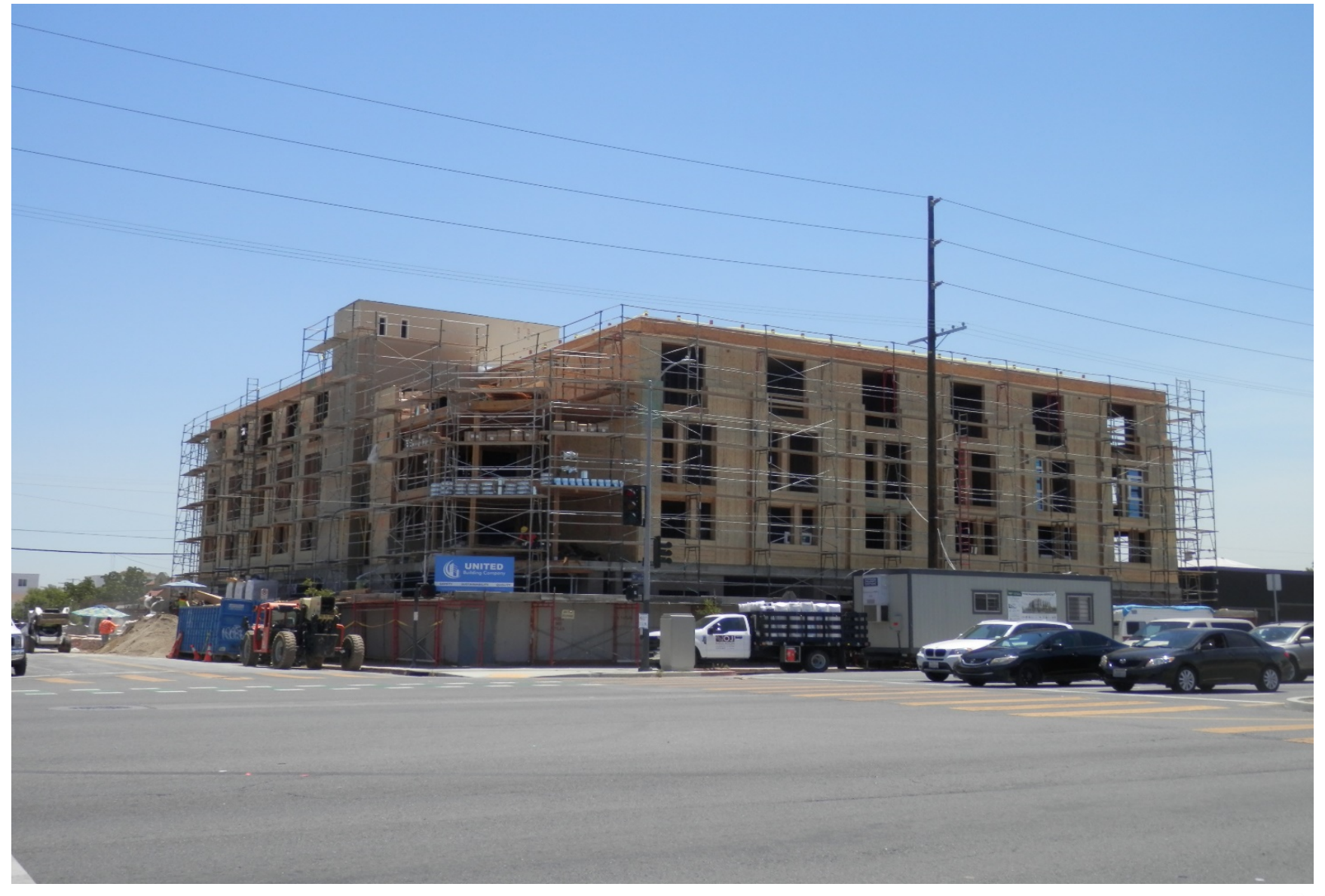
View from across the street at 7600 S Vermont.