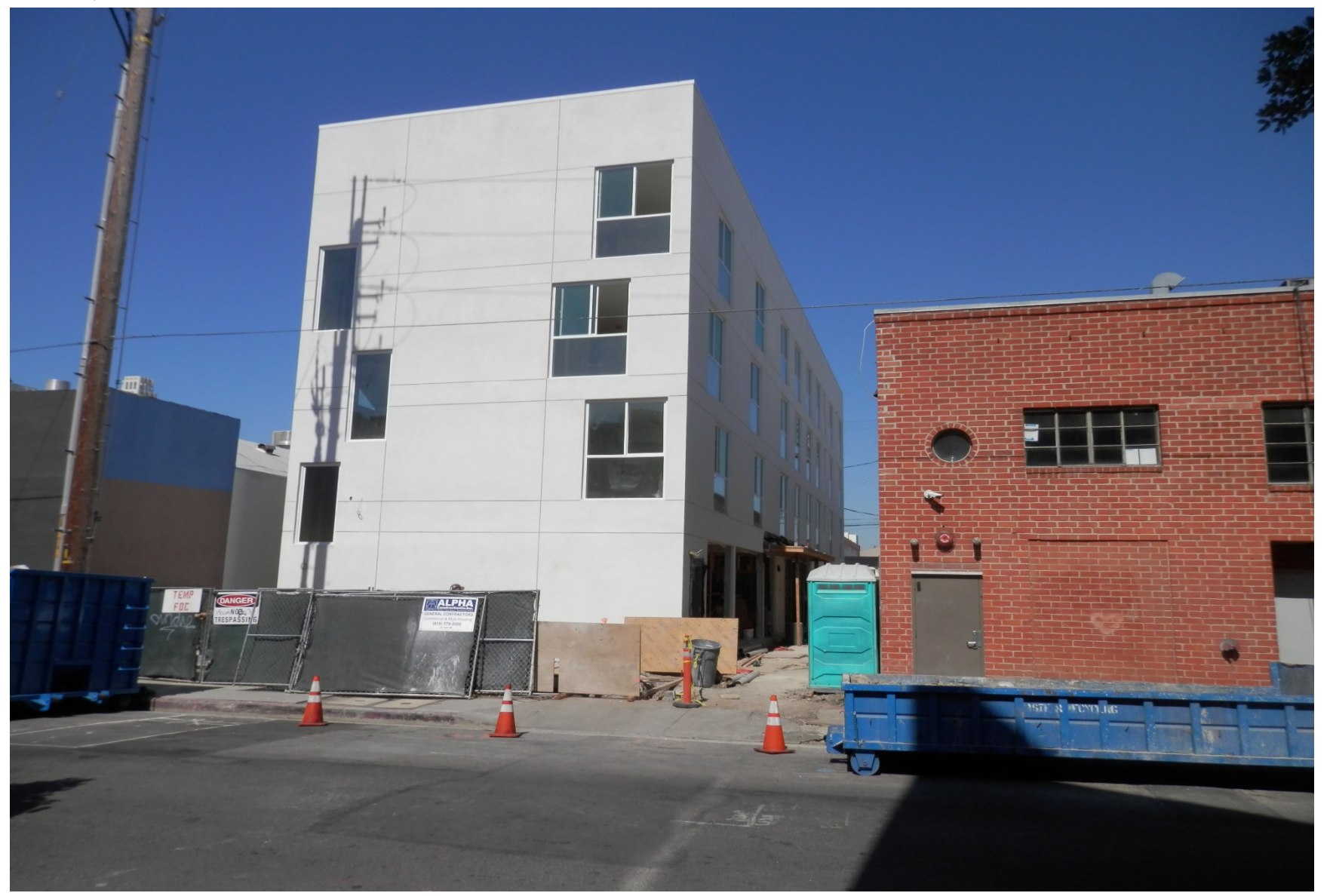
Located at 1119 N. Mc Cadden Pl. View from the front of site.