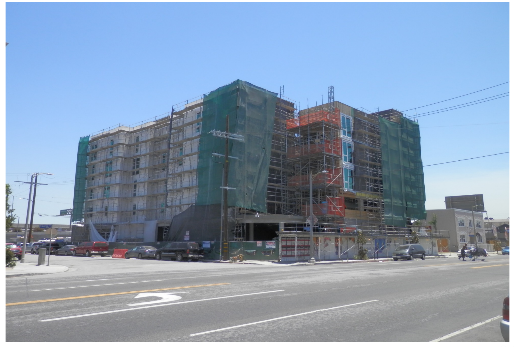
Located at 4050-60 S. Figueroa St. View from across the street of site.