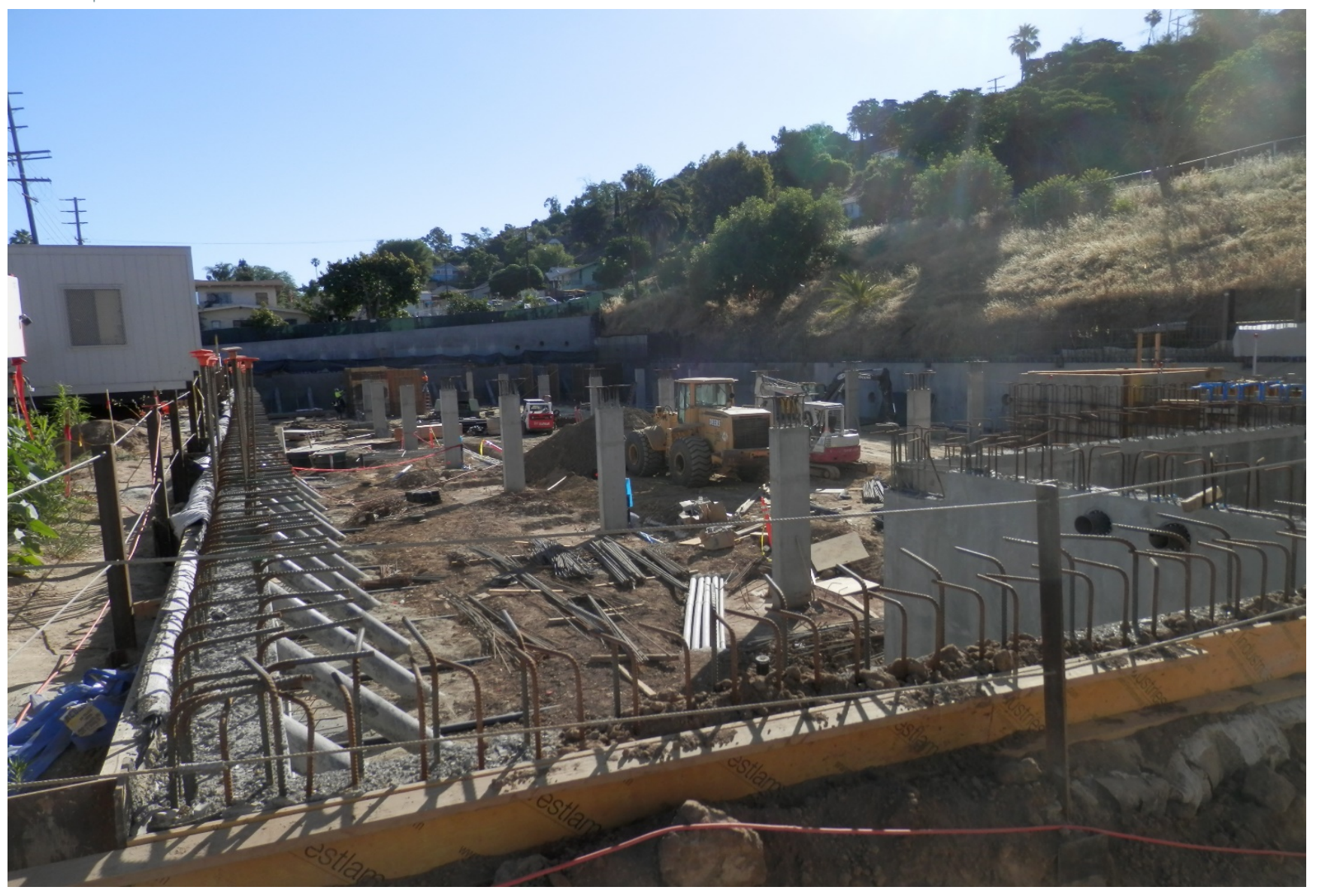
View from just inside the fence of situs at 4208 E Huntington Dr. South.