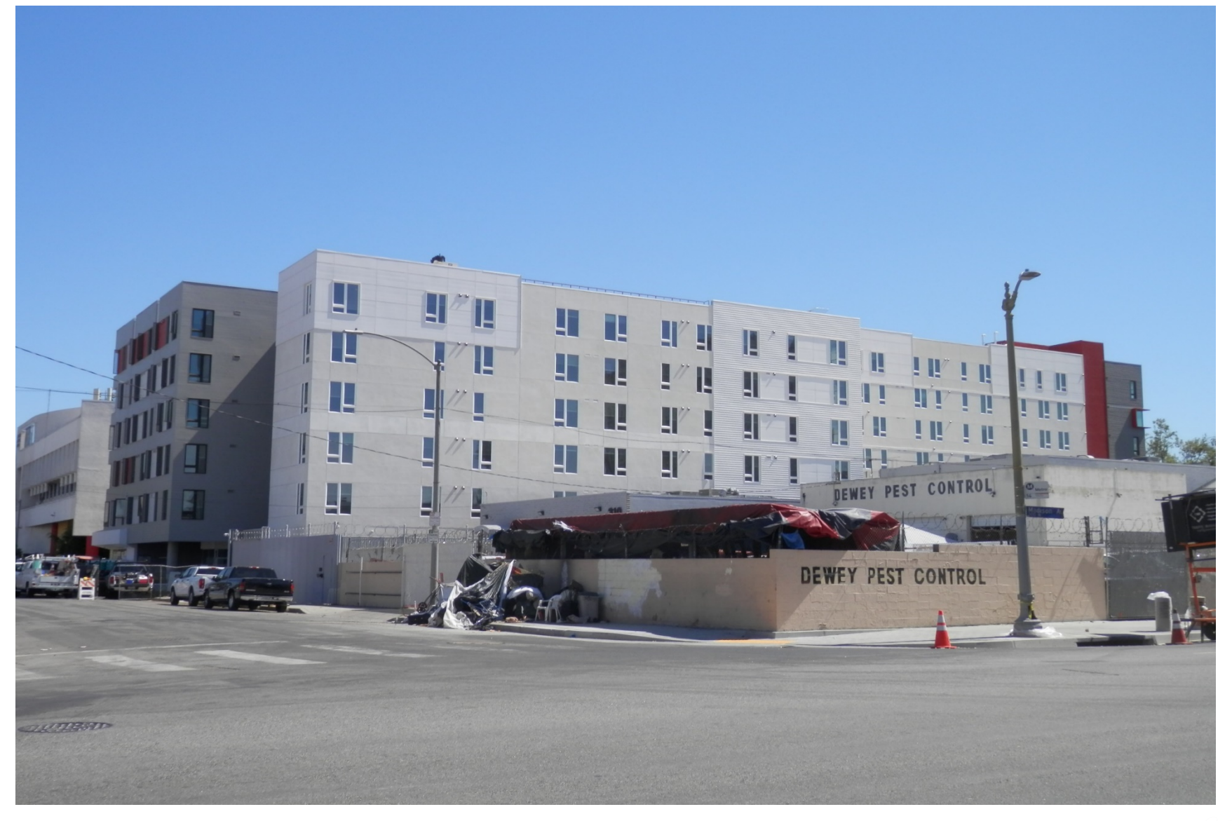
Path Metro Phase 2. View of site at corner of Beverly Blvd & Madison Ave.