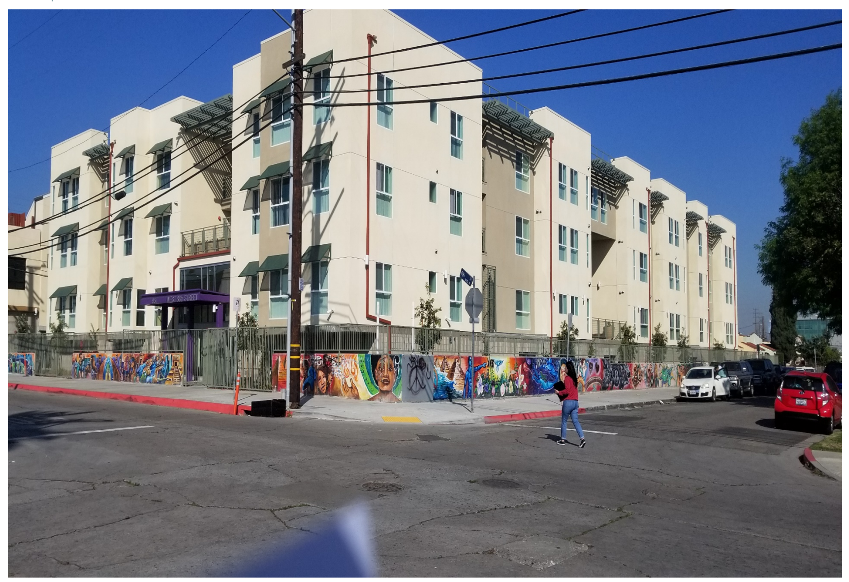
Located at 8707-27 S. Menlo Apts. Bldg 2 residential. View from Menlo & 88th.