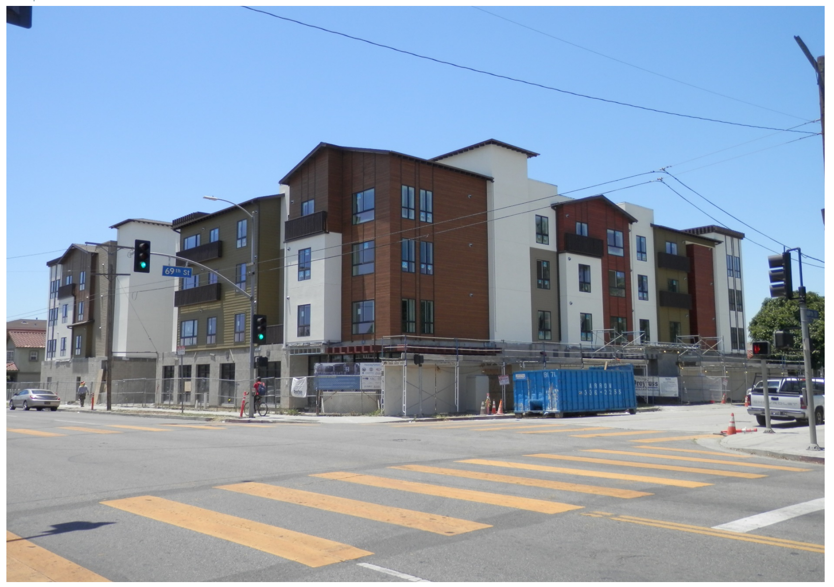
View from across the street on Main & 69th St.