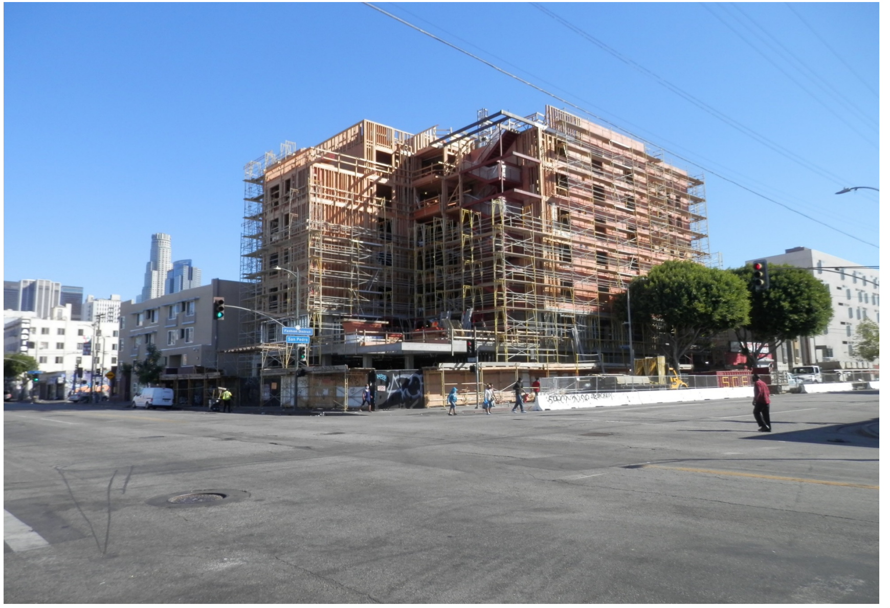
Located at 519 E 7<sup>th</sup> St. View from inside the construction fence on 7<sup>th</sup> St.