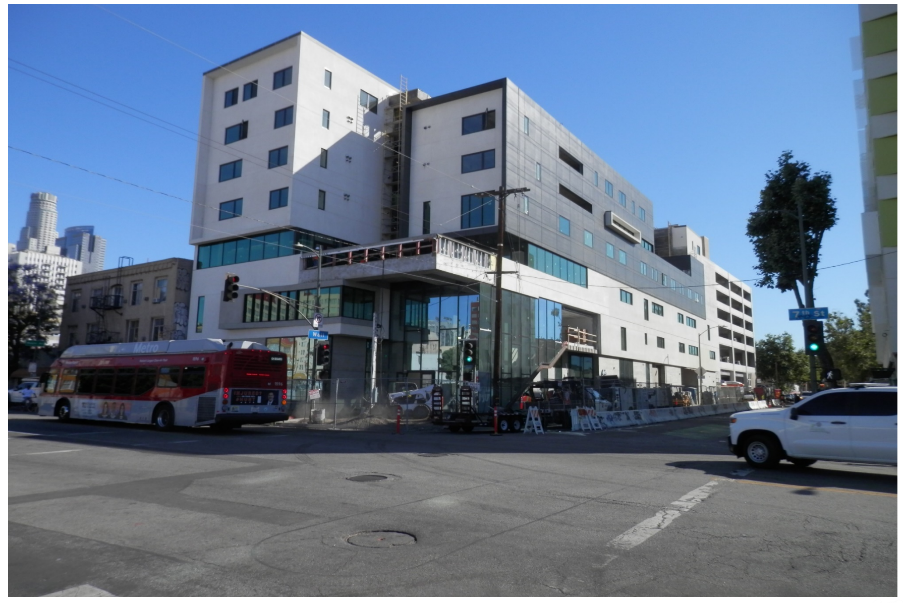
Located at 649 S. Wall St. View from across the street of 7th St. & Wall St.