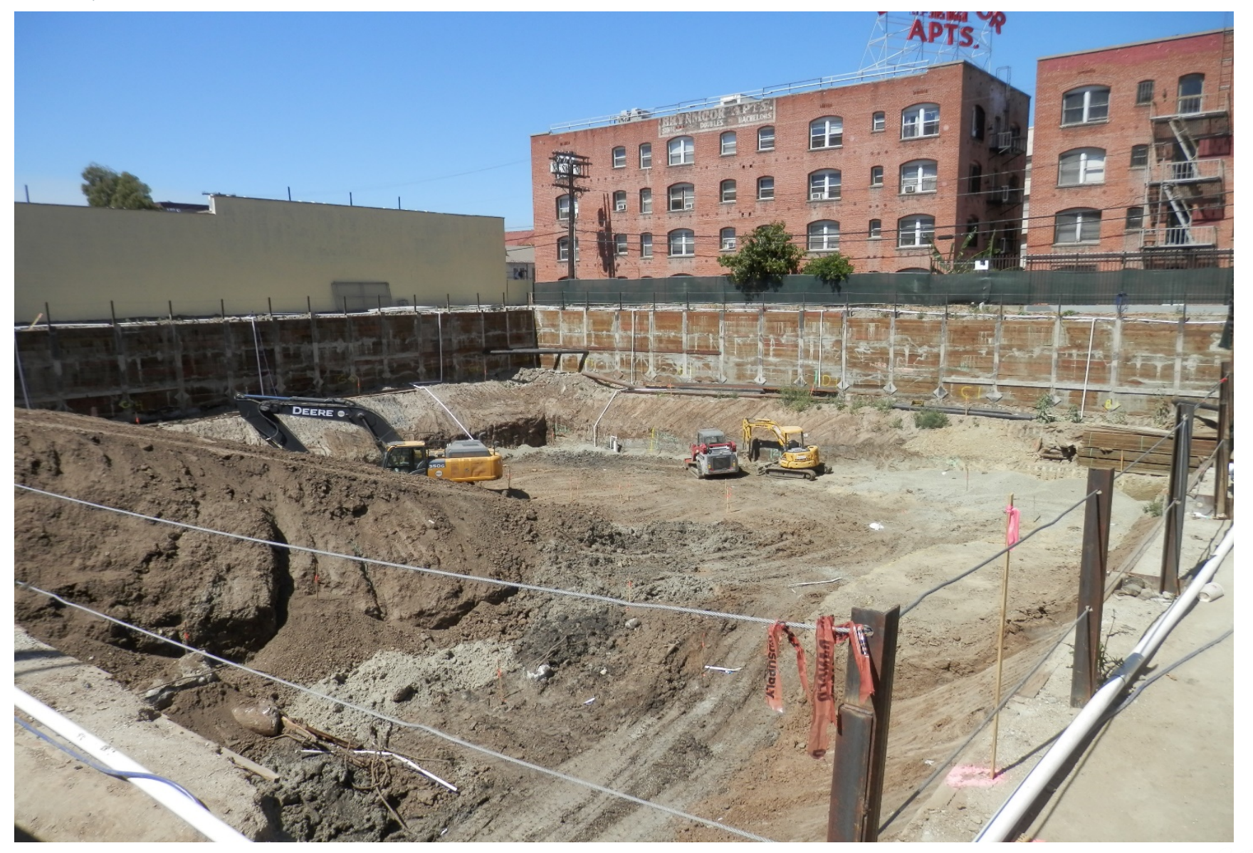
View from inside of the construction fence at 433 S Vermont.