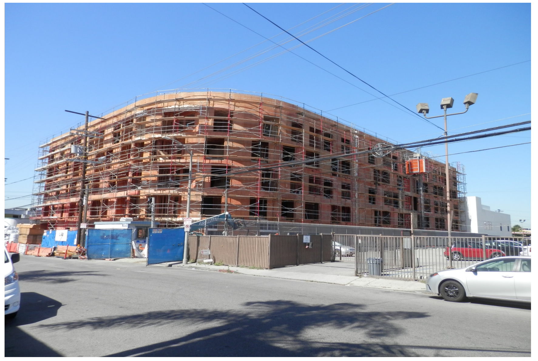
Located at 1127 N. Las Palmas. Street view from front of site on Las Palmas St.